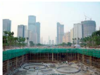
PRNT viewing towards north (before the Asian Games) (c) Author, September 2010