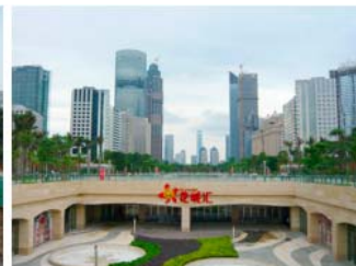
PRNT viewing towards north (after the Asian Games)