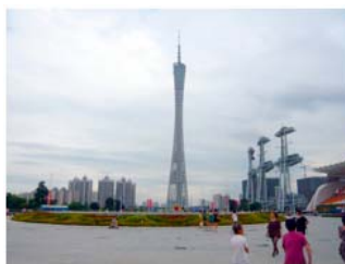
View towards Guangzhou TV Tower and Haixinsha Island (c) Author, May 2011