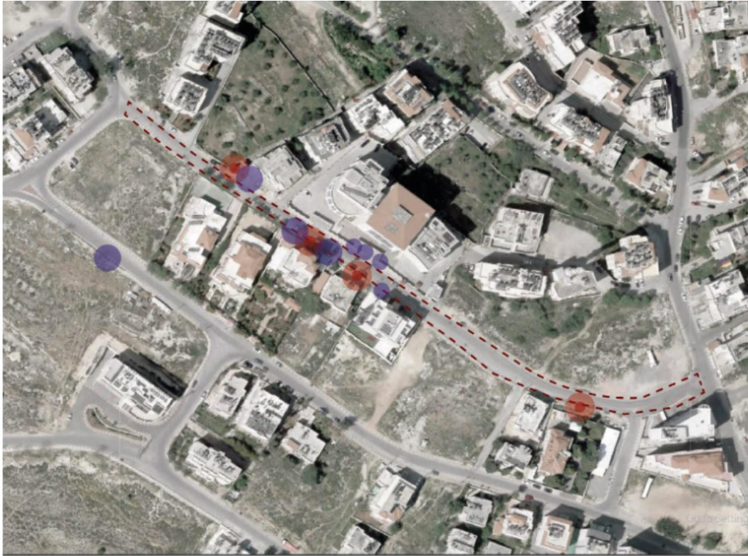
A Map Showcasing Place of Socioeconomic Interactions in the Neighbourhood