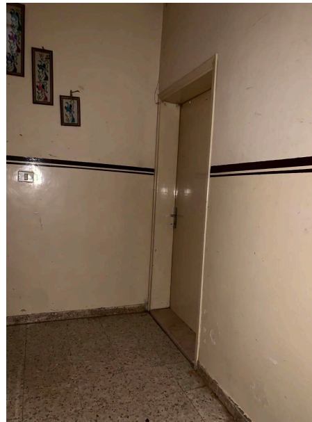
Figures 4 & 5: The backdoor of the supermarket from the residential building (the student's fieldwork, 2022).