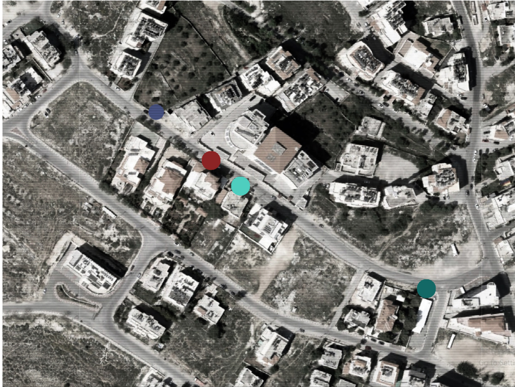
A Map Showcasing Economic Activity Location in the Neighbourhood During the Pandemic