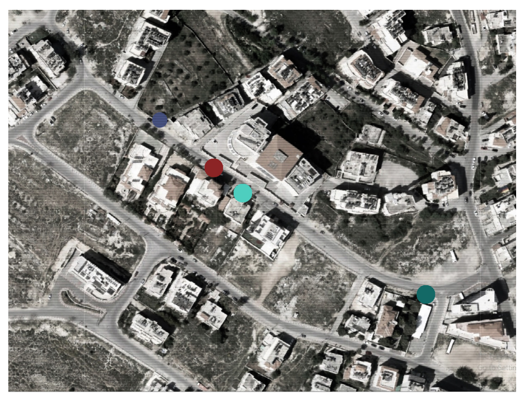
A Map Showcasing Economic Activity Location in the Neighbourhood During the Pandemic