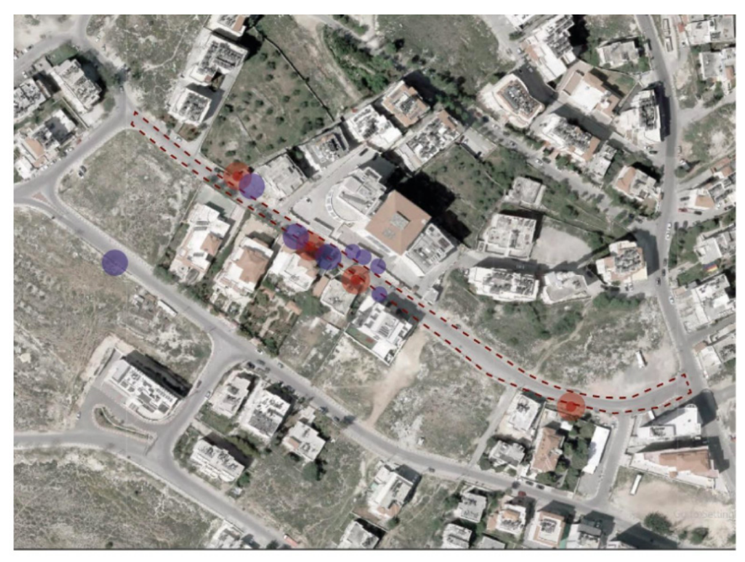
A Map Showcasing Place of Socioeconomic Interactions in the Neighbourhood