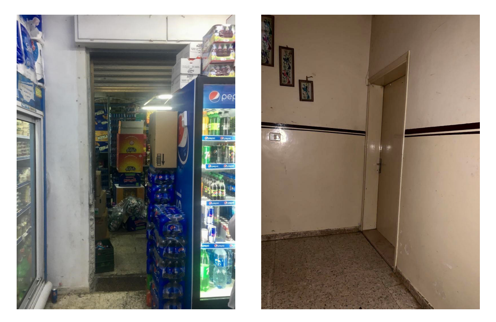
Figures 4 & 5: The backdoor of the supermarket from the residential building (the student's fieldwork, 2022).

Socio-economic activities increased significantly in this neighbourhood, as one of its local supermarkets remained open despite the lockdown. This was partly possible given that the shop had a back door accessible through the owners' home. This indicates a different form of repurposing during the pandemic, where some private spaces became an extension of or an alternative to public space, creating an overlap between the private and the public. The supermarket became a landmark of Al-Massayif neighbourhood, attracting customers, and rendering the street a public and social place. Different informal businesses emerged in response to increased social engagement, including kiosks to sell sweets, grilled food, falafel, etc. The wider neighbourhood was transformed to a gathering space, young people began to invite their friends from other neighbourhoods to spend time and eat snacks, rendering the space an alternative to the inaccessible city centre.