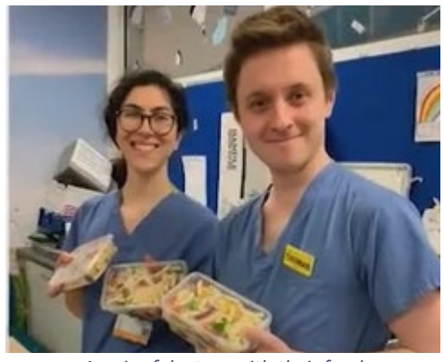
A pair of doctors with their food

The founder began by approaching friends and family over social media asking them to provide sponsorship for him to cook meals for his friend, who was a doctor, and their colleagues. The friend had said they would like healthy home-cooked food to help them on their shifts. Following this, he was put in contact with other hospitals across London. As demand grew, he realised he needed other volunteers to help cook and distribute the food. A friend set up an Instagram account to ask for more donations and volunteers. Within six weeks, Furloughed Foodies had raised £25,000 and recruited 400 volunteers. The group now has 700 volunteers signed up and seven key organisers including a fundraiser, head of social media, and two operations leaders who coordinate the volunteers and create