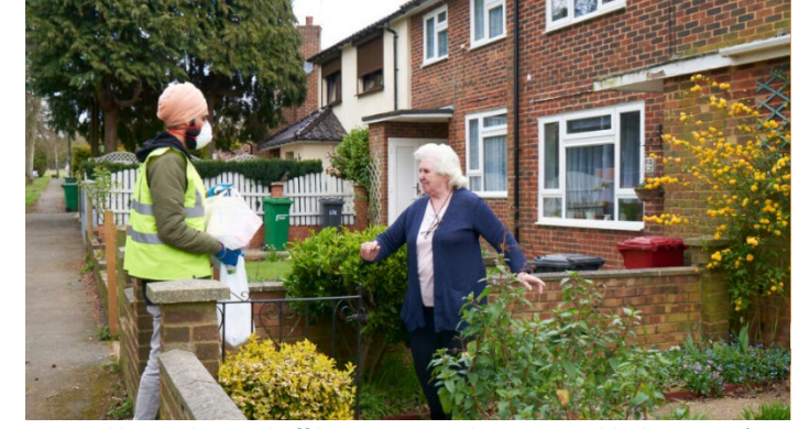
Food being dropped off by a GMGG volunteer an elderly woman's house

migrants with no recourse to public funds, who previously supported themselves through cash in hand jobs and are no longer able to work due to the pandemic. Moving out of lockdown, members of the temple are concerned about mental health issues that will have arisen as a result of the crisis. They are working closely