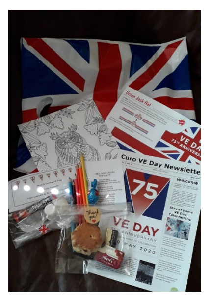
A VE day goody bag provided by Curo

During the crisis housing associations have played a vital role in supporting their tenants and staff and many have gone above and beyond their day to day duties. One example of this is Curo, a housing association based in Bath, who have provided extra support for tenants in their 800 sheltered housing properties. Many of the tenants are over 80 and self-isolating due to the pandemic.