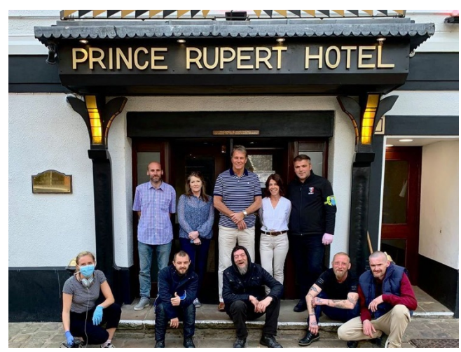
Hotel staff and individuals being housed outside the hotel

The council provide the hotel with a contribution towards their basic costs, such as insurance, but the project would not have been possible without the hotel's bank, Handelsbanken, freezing mortgage payments and increasing the hotel's overdraft. Business rates payments were also halted. Without this, the owner would not have been able to afford to house the rough sleepers and would have had to furlough all his staff.