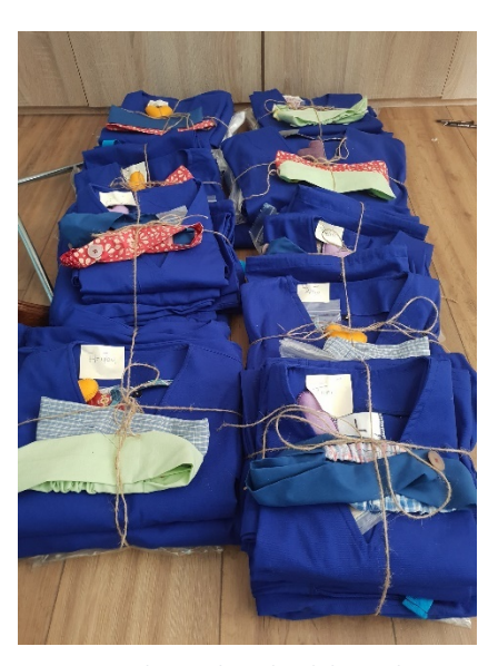
Scrubs ready to be delivered

"Scrub Hubs" are teams of volunteers who sew scrubs, which are then distributed to local hospitals, nursing homes, hospices and opticians. The Scrub Hub Durham was set up by an individual who heard about the Scrub Hubs over Facebook and realised there was no hub in the North East.