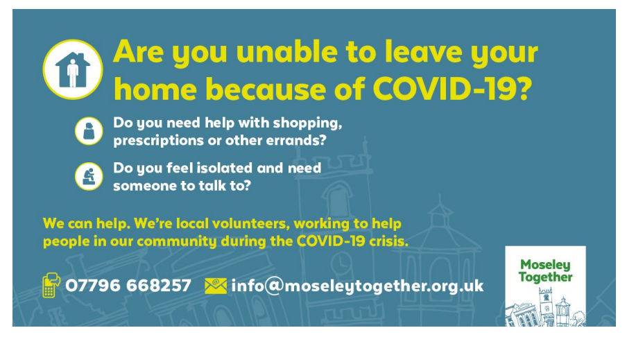
A leaflet advertising Moseley Together's support

The group are hopeful it will continue to support people after lockdown lifts. It has created a WhatsApp group with the local leaders of each ward to try and create a plan for what their role will be going forward. They think having the support of the Community Development Trust will be extremely helpful as they have paid staff who will be able to support the group when many of the volunteers go back to work after the end of furlough. As well as supporting individuals, the group is starting to explore how they can support local businesses who may be struggling due to the lockdown restrictions.