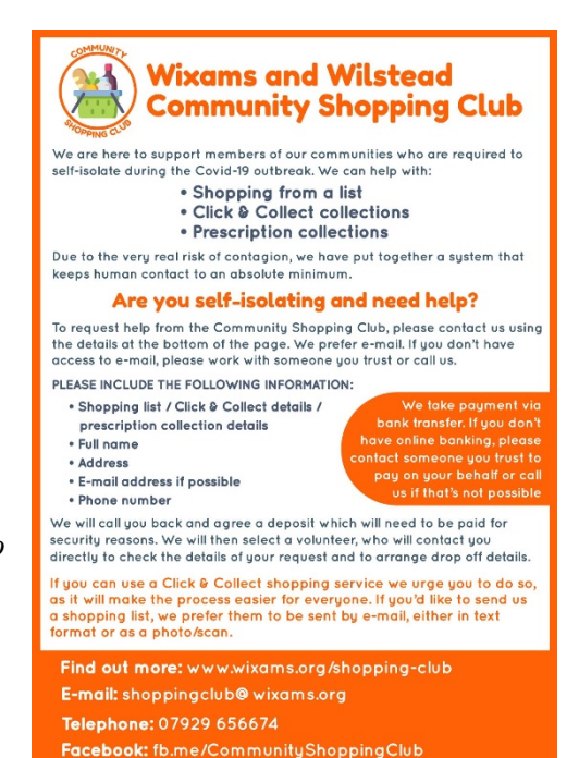
A poster advertising the services the shopping club offers

The Wixams and Wilsted Community Shopping Club was set up by two Good Neighbours groups from neighbouring villages in Bedfordshire, to support people