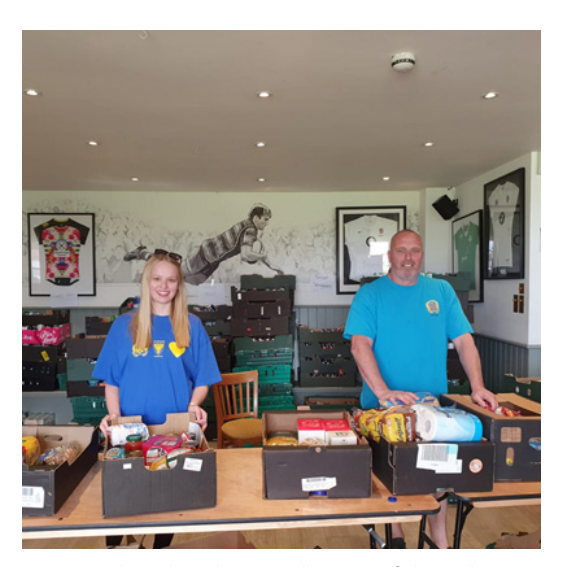
Food ready to be sorted at one of the Hubs

Dons Local Action Group was set up by a group of AFC Wimbledon Football Club fans who were fundraising