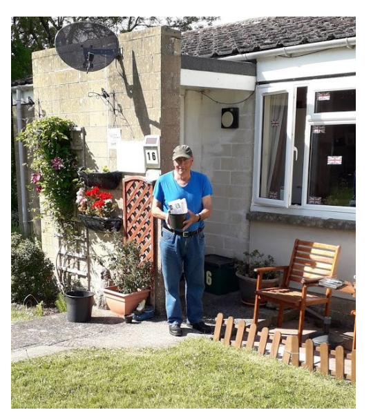
A Curo tenant with their sunflower growing kit

To fit in all the activities on top of the officers day-to-day to duties she is going above and beyond her normal working hours, but she says this "can be a challenge but seeing the residents faces when an activity is delivered is more than worth the hard work".