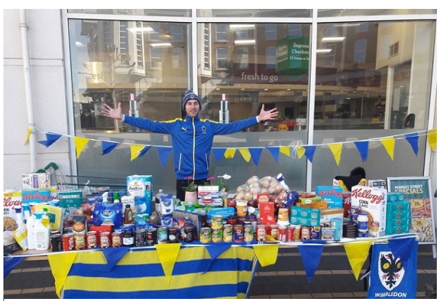
A food collection stand outside a supermarket

The group hopes it will continue to tackle food poverty after lockdown lifts. They are currently reviewing what capacity people will have to help going forward, and likely volunteer availability. They feel their model of collecting food outside supermarkets works well but they may have to scale back the number of shops they collect from once people start to go back to work.