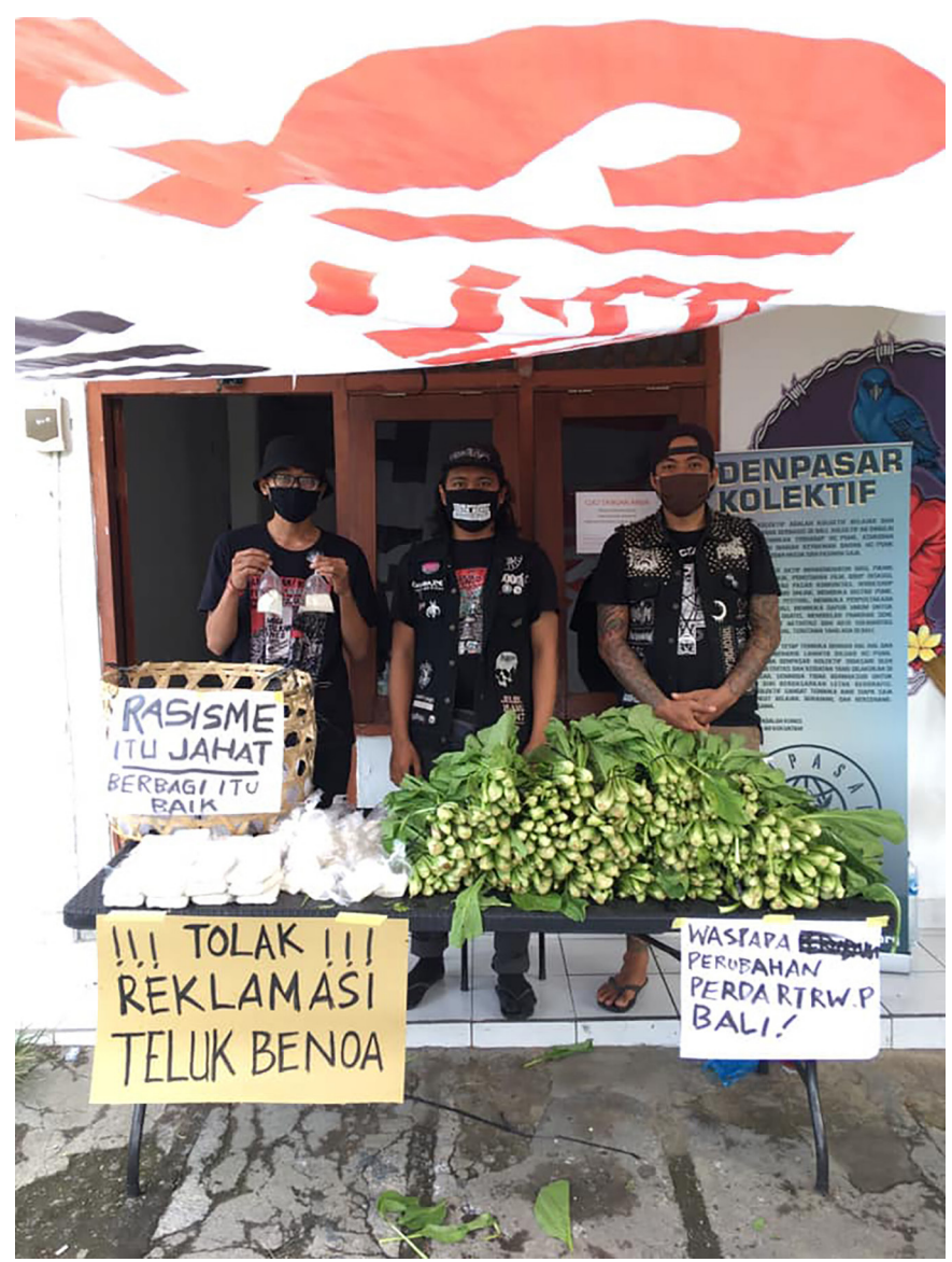
Figure 18.4. 'Punk-Pangan' – free vegetable distribution at WALHI, Denpasar