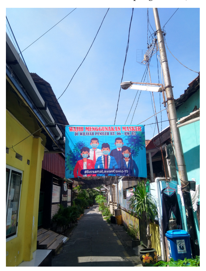
Figure 18.2. Mask mandate banner in Kampung Peneleh, Surabaya