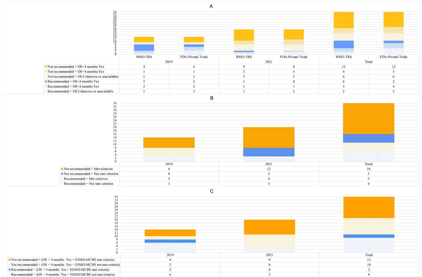
Figure 2 Evidence of overall survival (OS) benefit and scores on ESMO-MCBS in applications for targeted cancer drug indications, 2019–2021. (A) Evidence of OS benefit, 2019–2021; (B) Whether ESMO-MCBS of A or B in the curative setting and of 4 or 5 in the non-curative setting, 2019–2021; (C) Whether Met Both the OS Benefit >4 months and the ESMO-MCBS criteria. FDA-pivotal trials were obtained from FDA approved-labels. Tislelizumab (EML decision year 2021) is not approved by FDA, and the label is not available. Those corresponding cancer drug indications were categorised as not having documented evidence of OS benefit based on FDA-pivotal trials. ESMO-MCBS, European Society for Medical Oncology-Magnitude of Clinical Benefit Scale; FDA, Food and Drug Administration; WHO-TRS, WHO Technical Report Series.

EMLs. We further analysed the selection of targeted cancer drug indications in terms of OS benefit based on WHO-TRS and pivotal trials (as reported in FDA-approved drug labels).