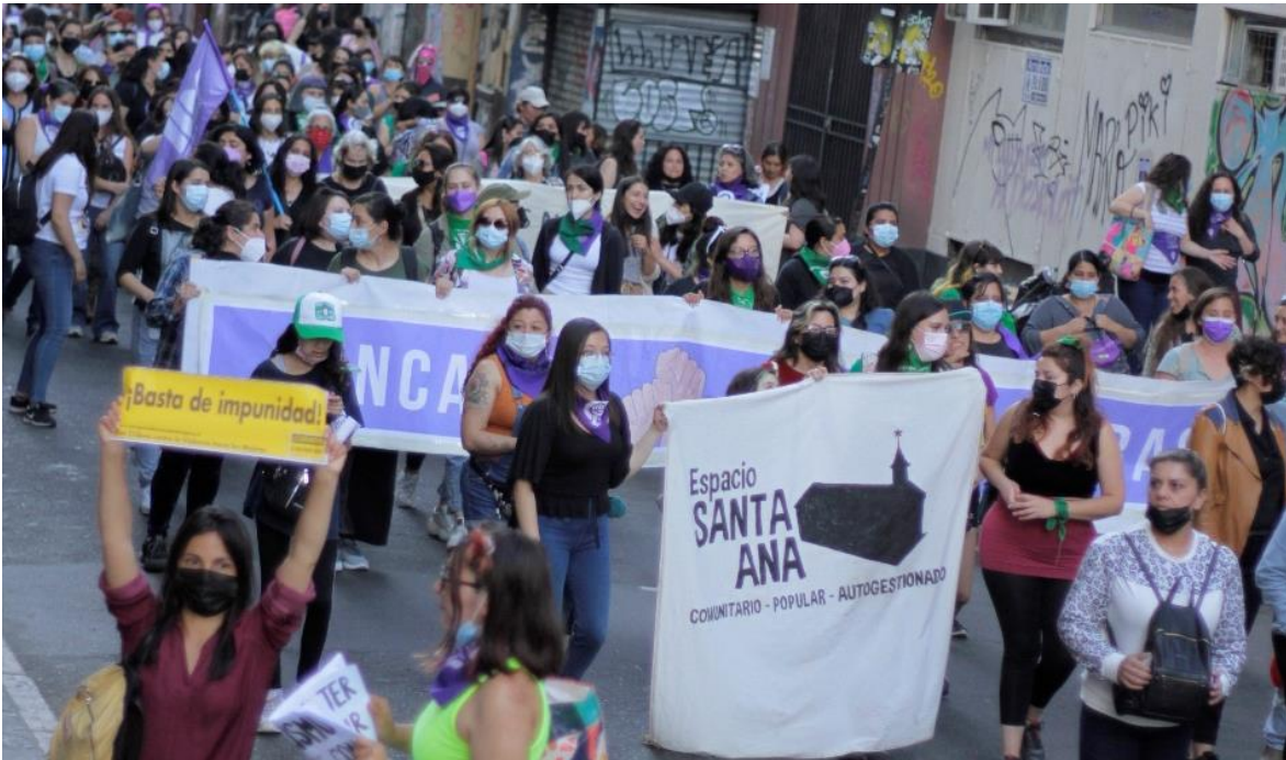
Demonstration in Valparaíso, International Day for the Elimination of Violence against Women, 25/11/2021

As activists, to quote Juliet Kirkwood, we had the ‘desire to extract from the archives of hidden female stories their gestures, their urgencies, their hastes and their anger...’ (Kirkwood, 1987, p. 23). Today, having closed off part of a route and with the clarity that we only understand part of that knowledge, we are certain that ‘today we know all that, because we have learned many things through experiences...’ (Kirkwood, 1987, p. 32), in this case the experience of the Valparaíso women in their ineffable drive to defend their lives and those of others, together.