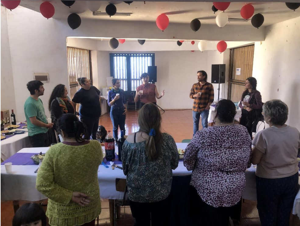
Workshop in Porvenir, Valparaíso.

In this account, the process of collectively tackling the consequences of violence was clear. This strategy, which emerged in the context of COVID-19, is ongoing. It takes place with other groups of women and seems to be rooted through the local history.