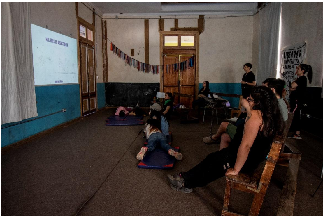
Workshop in Santa Ana, community center, Valparaíso.