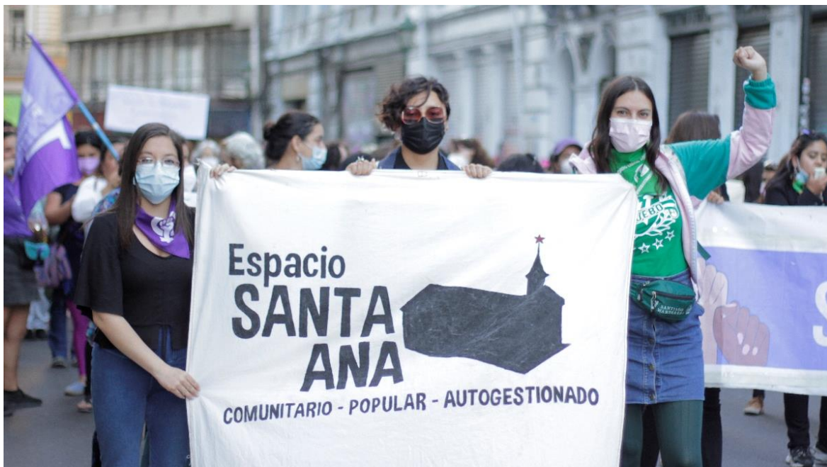
Demonstration in Valparaíso, International Day for the Elimination of Violence against Women. Source: Anita Peña Saavedra and Camila Rodó Carvallo 25/11/2021

This collective dimension, of observing us all as part of the system, is what has been absent in the state's response. In this sense, research becomes a contribution, as it offers reflections that open up some pathways. Firstly, understanding that one possible way of tackling VAW is through the symposium of actions and players, that is, through actions with multiple players, drawing on forms of knowledge situated within the problem. Secondly, understanding that the state needs to return to this work, since the outsourcing of services has fragmented the local contingency network. Finally, understanding that in diverse geographical regions with marked social inequalities – as in Chile – it must be understood that the geopolitical organisation of actions cannot be detached from cultural relevance, regional roots or lived history. The women of Valparaíso have organised themselves beyond the physical limitations of their geography and have constructed a history of resistance that unfolds from their shared history with others.