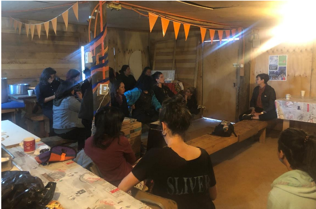
Workshop in Violeta Parra community, Valparaíso.