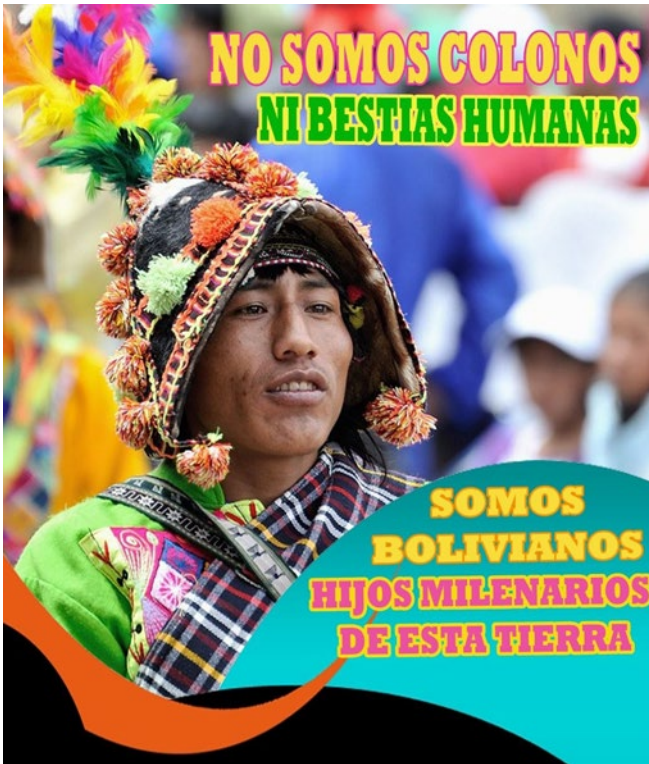
FIGURE 2. “No somos colonos, ni bestias humanas. Somos Bolivianos Hijos Milenarios de Esta Tierra.” Widely circulated meme (posted publicly on former Bolivian President Evo Morales Ayma’s Twitter feed, among other social media platforms) declares that as Indigenous Bolivians, “We are not colonos [indentured hacienda tenants] nor human beasts. We are Bolivians, millenarian children of this earth.”

political change as deeply fragile. Not only had racial hierarchies been reproduced in contemporary labor conditions (such as mines and domestic labor) and land hierarchies, but national political discourses, too, continued to withhold full humanity from the formerly subjugated. 32 The fragmentation of hacienda workers into deserving and undeserving recipients of state rights and resources was replicated in the micro-dimensions of daily life. This generated abiding sensibilities of blameworthiness, evident in the tendency to describe hacienda servants as culpable for their earlier subjection. At the same time, this narrative elicited new possibilities for making demands on non-Indigenous subjects, especially landowners, who could be newly cast as backwards vis-à-vis a revolutionary telos of Indigenous inclusion and rights.