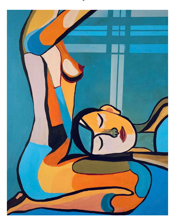
Figure 4: Solin Nirvana, Intimacy, acrylic, Acrylic on canvas, 2020

Pairs were also frequently painted; friends gently leaning on each other, or couples resting on the other's lap. This body of work illustrates what intimacy does or could look like; an intimacy away from society's norms and its conservative regulations around shame/honour; free of violence, with each in their power.