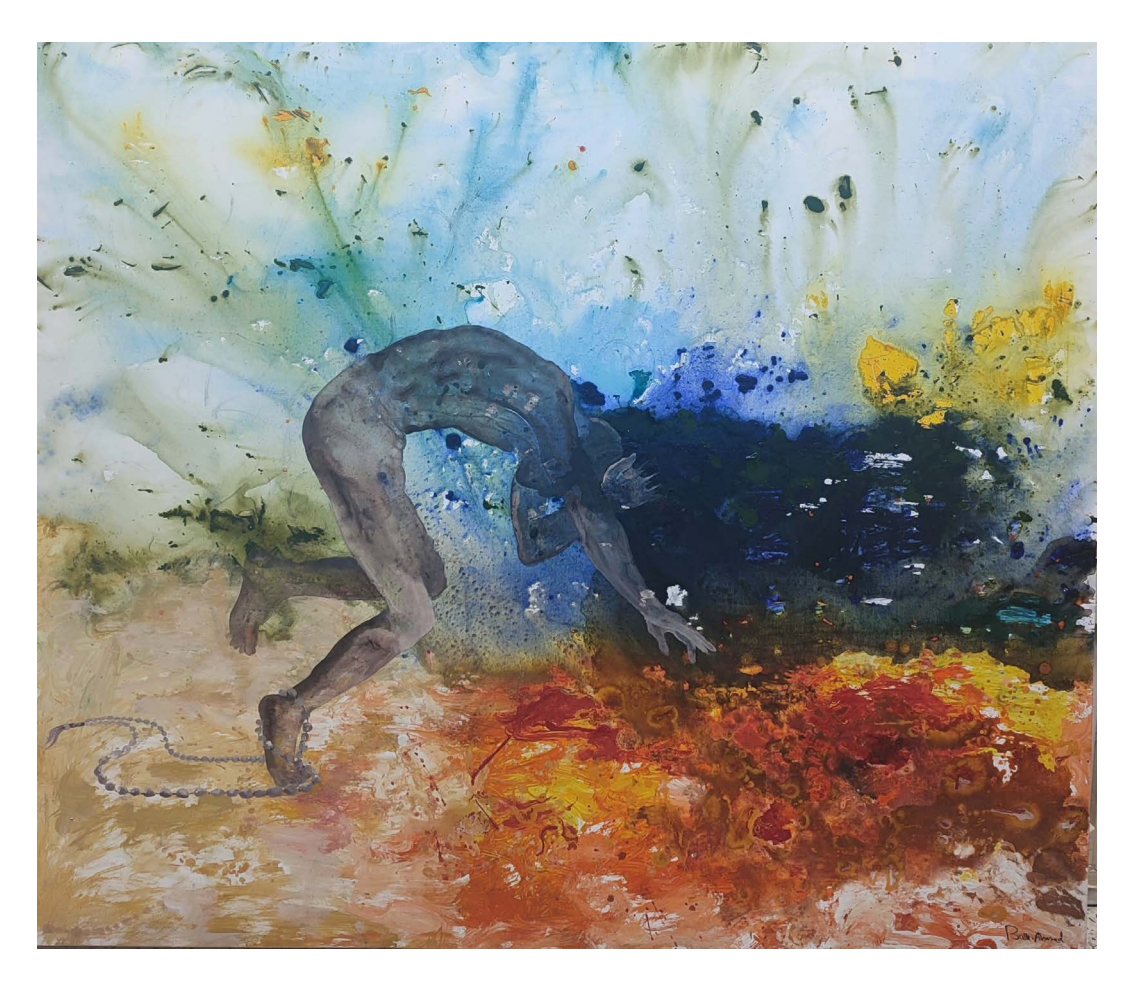
Figure 2: Bala Ahmed, Social Obstacles, Acrylic on canvas, 2022

Like Bala, a number of our respondents noted the increasing influence of Islamic parties in their spaces of work and activism. After the independence referendum in 2017, and the political crisis that followed it, Islamic parties attempted to fill the political vacuum and targeted youth, especially young girls. Artists, feminists and LGBTIQ+ activists, <sup>47</sup> who in recent years have gained some ground, are directly impacted by this Iraq-wide conservative backlash, <sup>48</sup> with concern mounting over the way in which conservative forces are increasingly dominating the already limited public spaces and debates about women, gender and sexuality. <sup>49</sup>