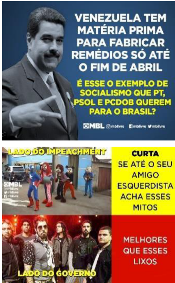
Figures 2 and 3 MBL Contents

Note. Reproduced from the MBL Facebook page, April 2016.