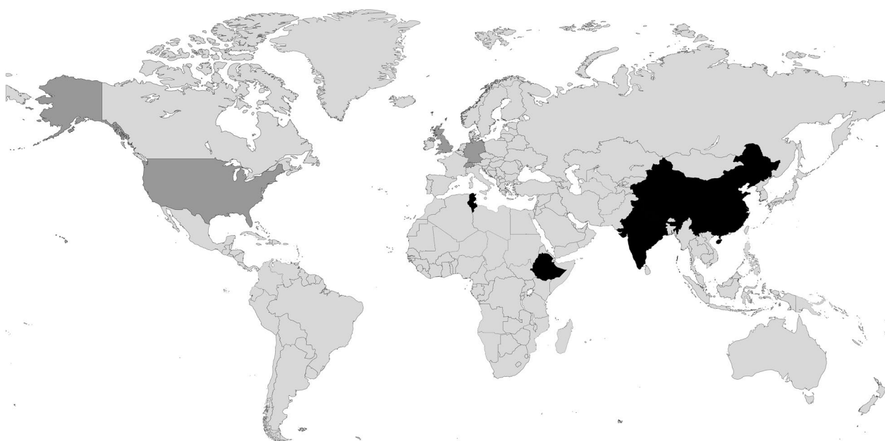
Fig. 2 Map indicating the countries where Indigo Partnership implementing partner institutions (highlighted in black) and collaborating partner institutions (highlighted in dark grey) are located