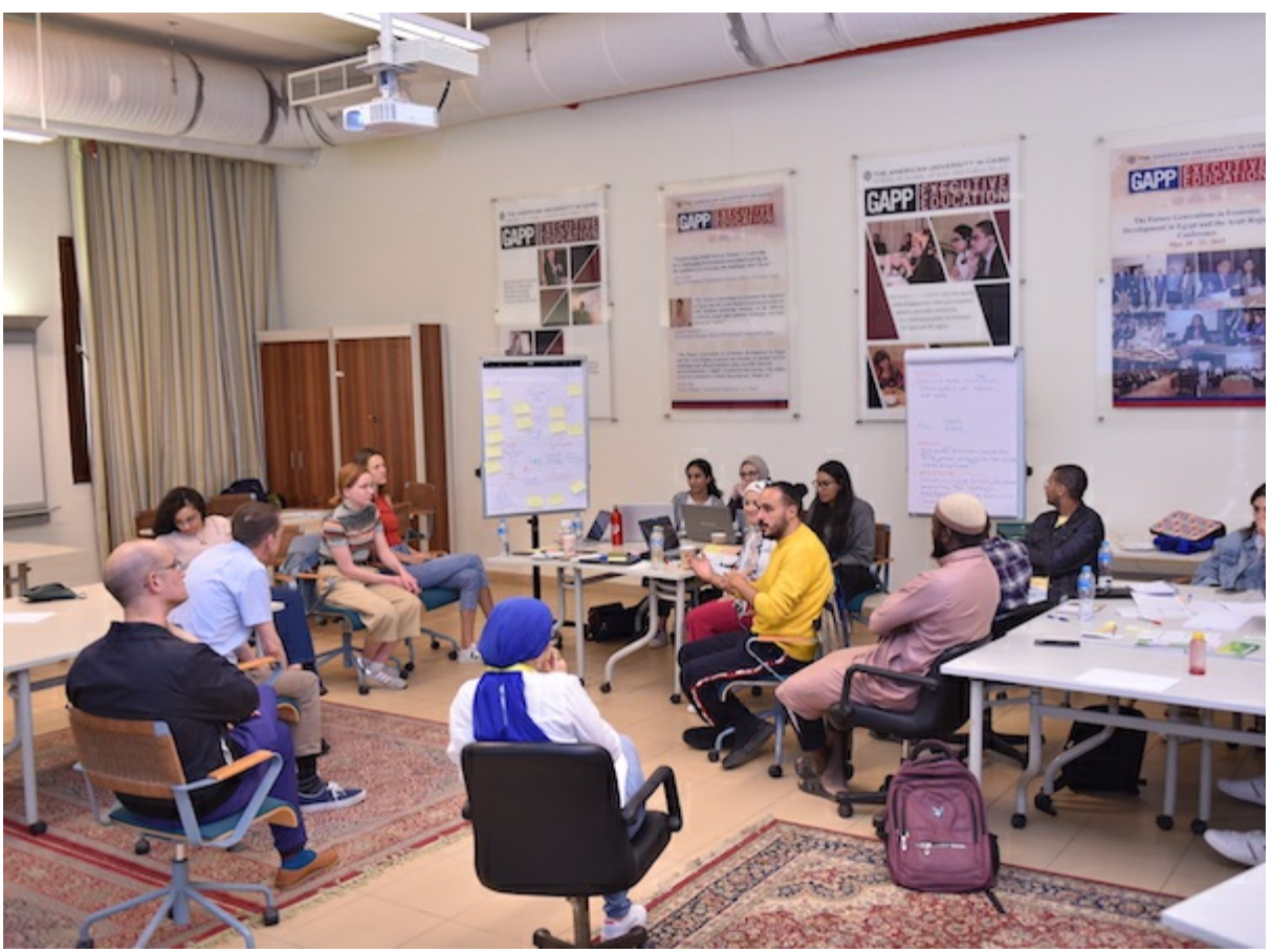
AUC-LSE Workshop, American University in Cairo, Egypt, November 4, 2022.

The climate emergency is an urban emergency. Cities, the processes of urbanisation, have been identified by scientists as the predominant sites of greenhouse gas (GHG) emissions. Rapid extended urbanisation around the globe – and particularly in the global south – has accelerated increases in emissions in recent years. While cities and urban infrastructure are a central vector of GHG emissions, they also offer a critical opportunity for adaptation and mitigation of climate change. Urbanisation has risen to the top of the