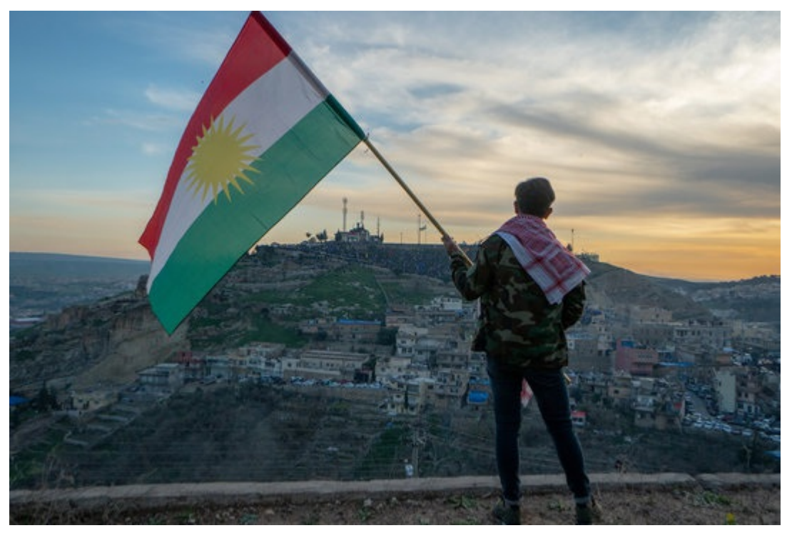
Teenager holding the Kurdistan flag in northern Iraq at sunset time on Nowruz, 2019.

The Kurdish people are most often described as the world's largest stateless nation. The phrase is indicative of the way we tend to look at the Kurds, which is, almost exclusively, through the prisms of nationhood and (denied) statehood. In recent years, the Kurds have enjoyed an unusually high degree of international media attention thanks to the role of Kurdish groups from Syria and Iraq in the war against ISIS, which raised worldwide sympathy for their national cause. In the same years, growing instability in the Middle East allowed for the establishment, in Syria, and consolidation, in Iraq, of two semi-independent Kurdish regions with their institutions and armed forces, an absolute novelty in modern history. Yet, despite this momentous advance, the Kurdish movement is more divided than ever, and competition overshadows cooperation to the point that