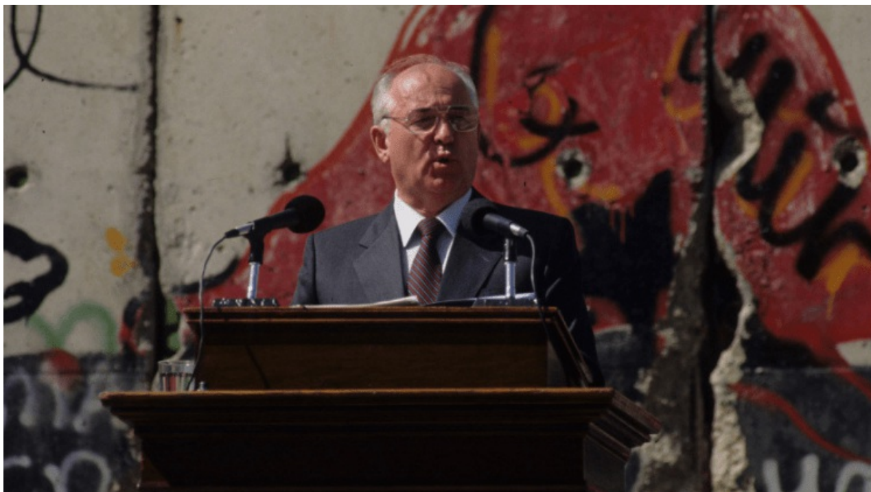
Image Credit: ' End of Cold War – Mikhail Gorbachev Event ' by Photographer/Studio SW licensed by Missouri State Archives, No Known Copyright Restrictions

Zubok's lengthy and detailed study is easy to read. It is crafted with a strong narrative approach to relate an unfolding drama. This not only keeps the reader's attention, but also provides a wealth of detail and analysis that can only be undertaken by someone with Zubok's lifetime of work on the subject.