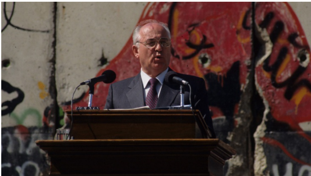
Image Credit: ' End of Cold War – Mikhail Gorbachev Event ' by Photographer/Studio SW licensed by Missouri State Archives, No Known Copyright Restrictions

Zubok's lengthy and detailed study is easy to read. It is crafted with a strong narrative approach to relate an unfolding drama. This not only keeps the reader's attention, but also provides a wealth of detail and analysis that can only be undertaken by someone with Zubok's lifetime of work on the subject.