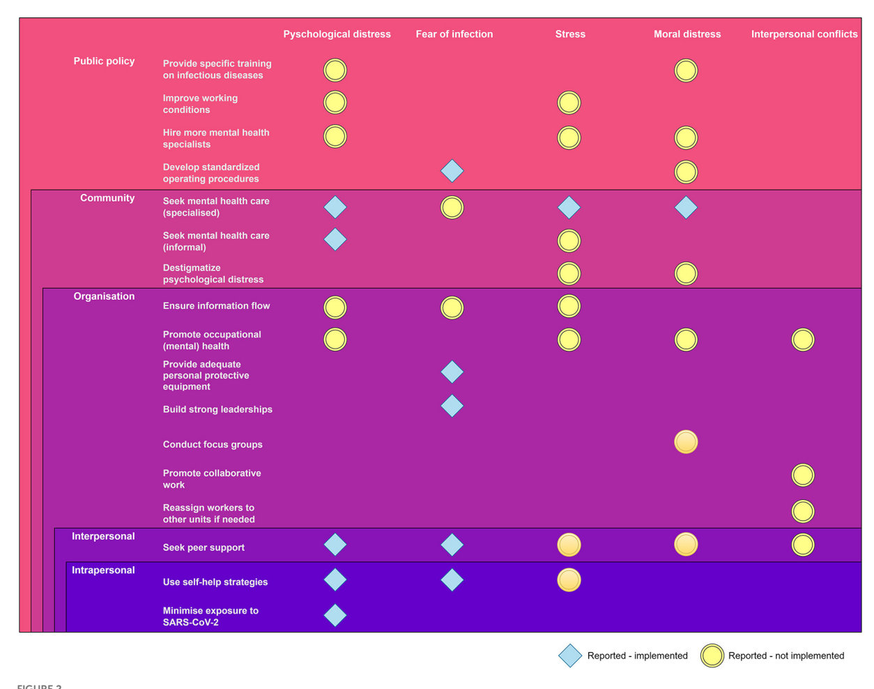
FIGURE 2 Strategies currently implemented (blue rhombus shapes) or requiring implementation (yellow circles) to improve frontline HCWs' mental health problems, as perceived by KI interviewees.

and moral distress ("Normalize the situation, you are not on your own, and many have been through the same thing as you; together, we can improve people92s resilience and resist without tearing apart" [PSSJD_08]).