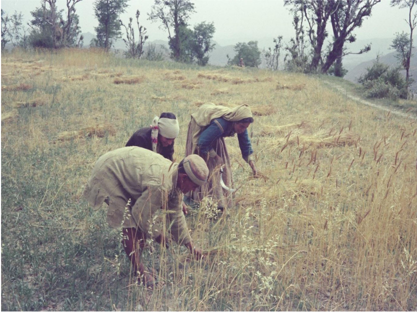
Figure 4. Three Gaddis threshing wheat, 1977. The one in the foreground is a sadhin . Peter Phillimore (1991) argues that the emergence of sadhin —Gaddi women who renounce marriage and sexual relations, wear the everyday clothing of Gaddi men and keep their hair cropped short—was a response to increasing anxiety about female propriety and domesticated labor. The social role allowed women to inherit property and grazing permits and to tend flocks in the absence of male heirs. [This figure appears in color in the online issue]

and our women don't need to work like that." Though they remembered hungry, dirty childhoods, they would not struggle for their own children's food.