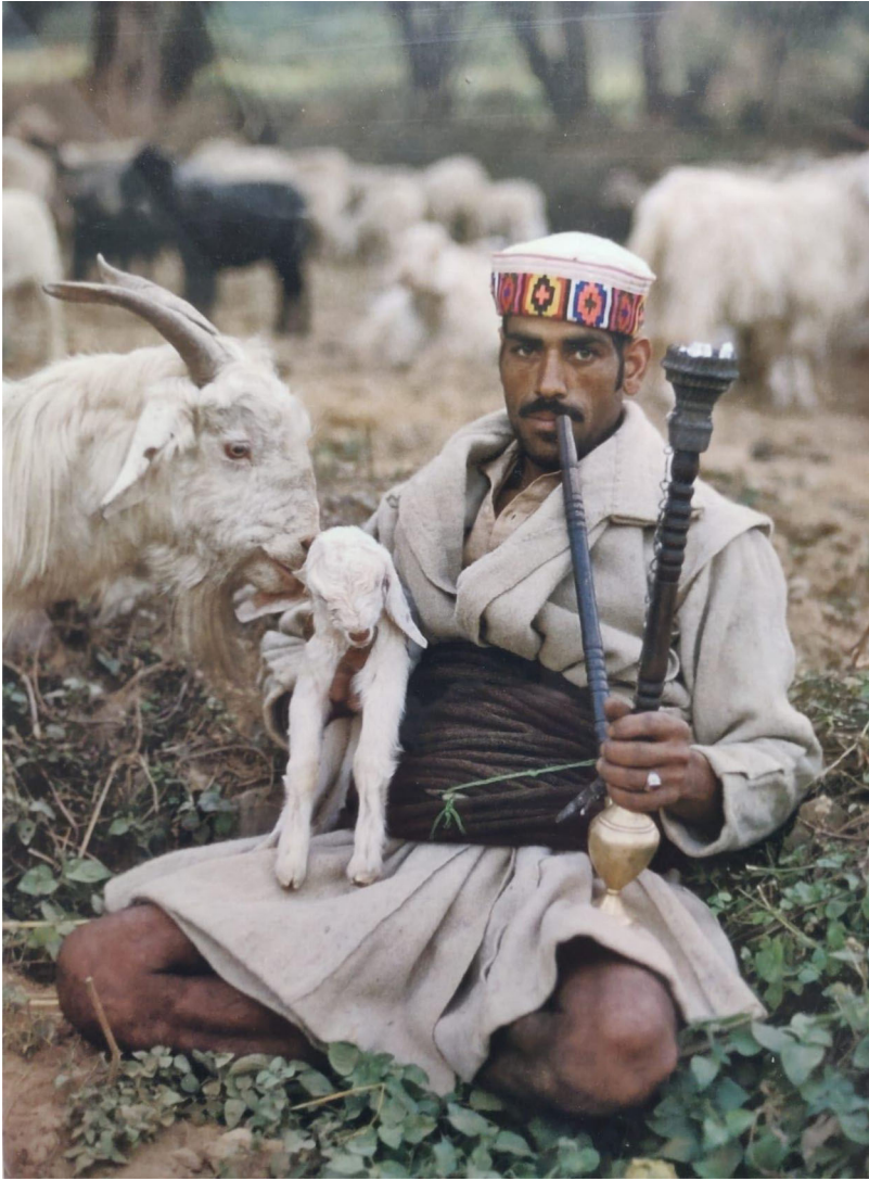
Figure 1. A Gaddi shepherd smoking. (Courtesy of Tejinder Singh Randhawa, ~1980) [This figure appears in color in the online issue]

negotiation, and production of wool and meat for market (see Figure 1). The distinctions of gender and caste were less pronounced in the western Himalayan regions than in the plains because local differences of wealth were less pronounced, and women of all castes took a prominent labor role in productive work (Barnes 1855; Berreman 1960; Sharma 1980).