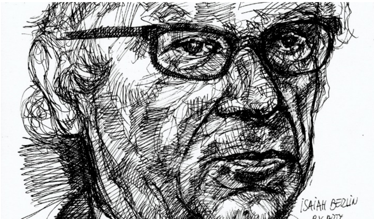
Image Credit: Crop of ' Isaiah Berlin for PIFAL ' by Arturo Espinosa licensed under CC BY 2.0

Realism in political theory, according to Hall, has been accused of being merely negative in nature, of pointing out (alleged) difficulties in other approaches while failing to offer arguments for viable alternatives. Therefore, Hall aims to show how Berlin, Hampshire and Williams contribute positive insights that can complement the negative claims of realism.