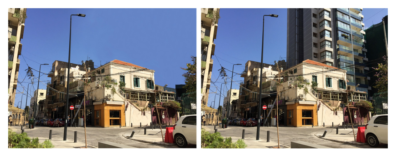
Figure 3. An example of a visualisation of BC: Before and after.

WTP as a proxy for resident willingness to stop unwarranted building. I also compare these results with other related indicators.