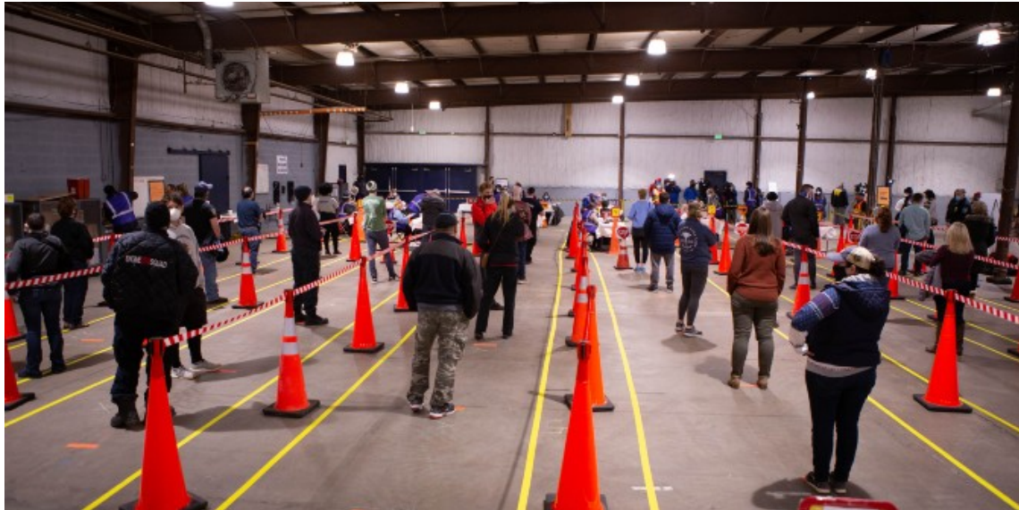
People queue to receive their COVID vaccines in Baltimore. Photo: Baltimore County Government . Public domain