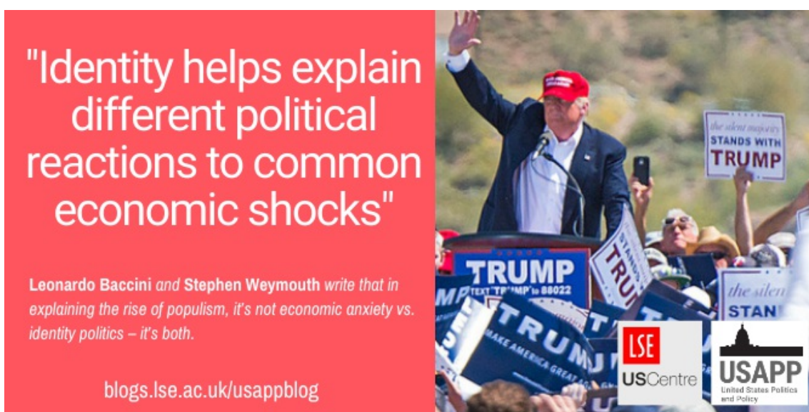
“Donald Trump”

We test this argument using new county-level data of manufacturing layoffs, which we link to county- and individual-level voting behavior. We find that voters punish Democratic incumbents more for white worker layoffs than for layoffs of people of color. Examining individual-level survey data, we find that layoffs are associated with greater support for Republican challengers among whites relative to voters of color. The estimated effects are particularly large in the 2016 presidential election in which Trump ran an America-First nationalist campaign and explicitly appealed to white racial grievance linked to industrial decline. In contrast, voters of color were likely to support Democratic candidates. These findings indicate that voters of color repudiate the reactionary brand of politics centered on industrial revival and the reaffirmation of racial hierarchy, especially in deindustrializing localities.