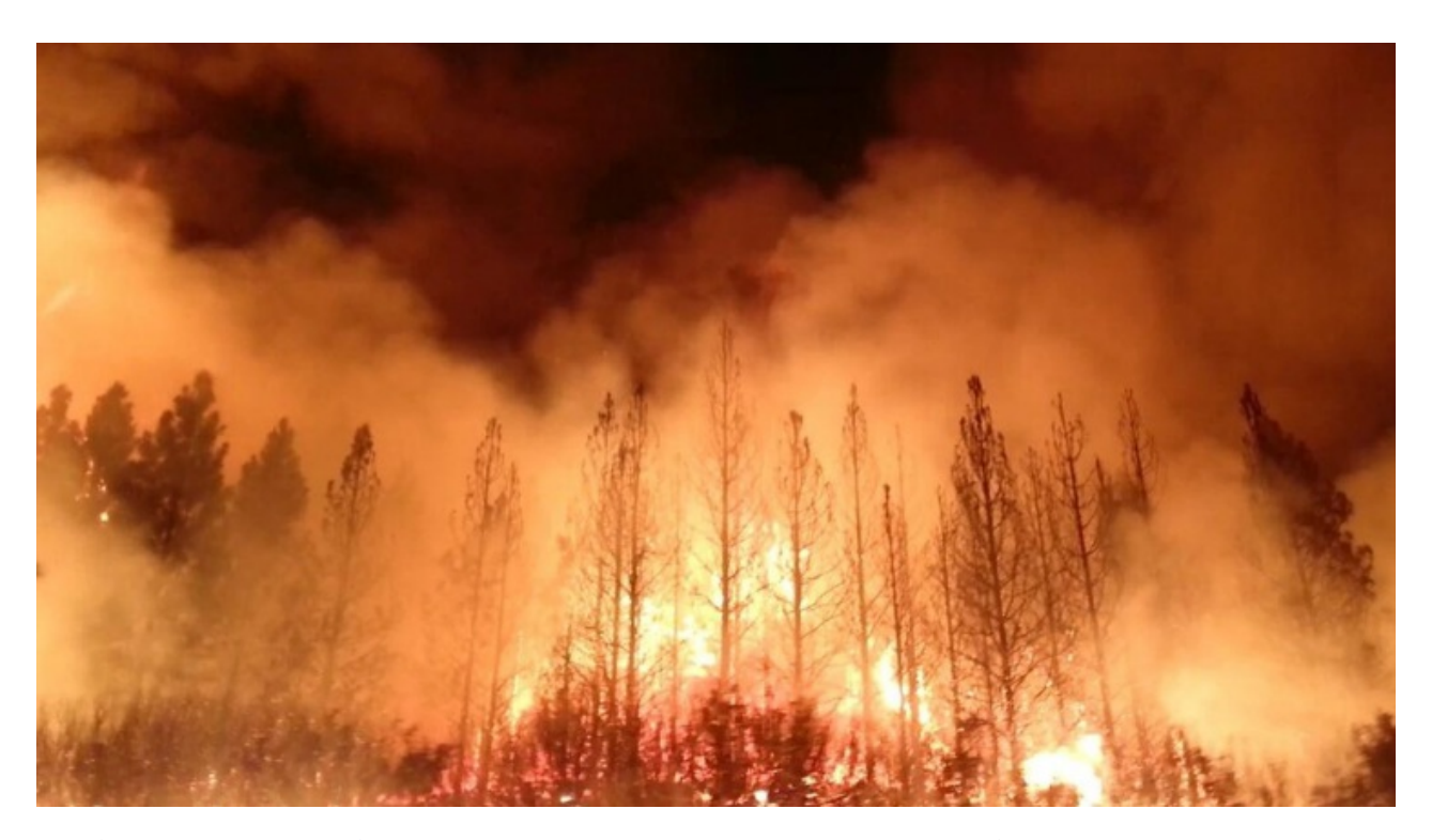
Image Credit: <u>'20130817-FS-UNK-0004'</u> depicting The 2013 Rim Fire in the Stanislaus National Forest near in California. Image by <u>U.S. Department of Agriculture</u> and licensed under <u>CC BY 2.0</u>.

Several policy areas resultantly emerge, rooted in the need to holistically rethink 1) finance; 2) ownership models; 3) work; and 4) a commons for the 21st century. First is the importance of definancialisation, including advocacy of green investment in the real economy, mission-driven public banks, green fiscal and monetary reform, and challenging the asset management industry. Second is promoting democratic economic ownership models, limiting shareholder influence and rewiring the perceived extractive compulsions of the corporation. Third, is the need to separate work and income, to decommodify the economy, decarbonise our use of time, and expand low carbon work such as care. Fourth, is the call for a 21st-century commons: the sharing of resources and services stewarded for the public good, from digital infrastructures, to mobility, to land use.