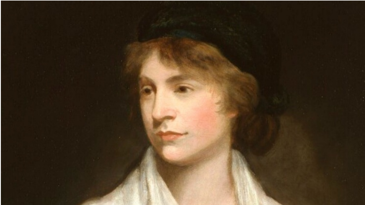
Crop of 'Mary Wollstonecraft' by John Opie, oil on canvas, circa 1797. NPG 1237.