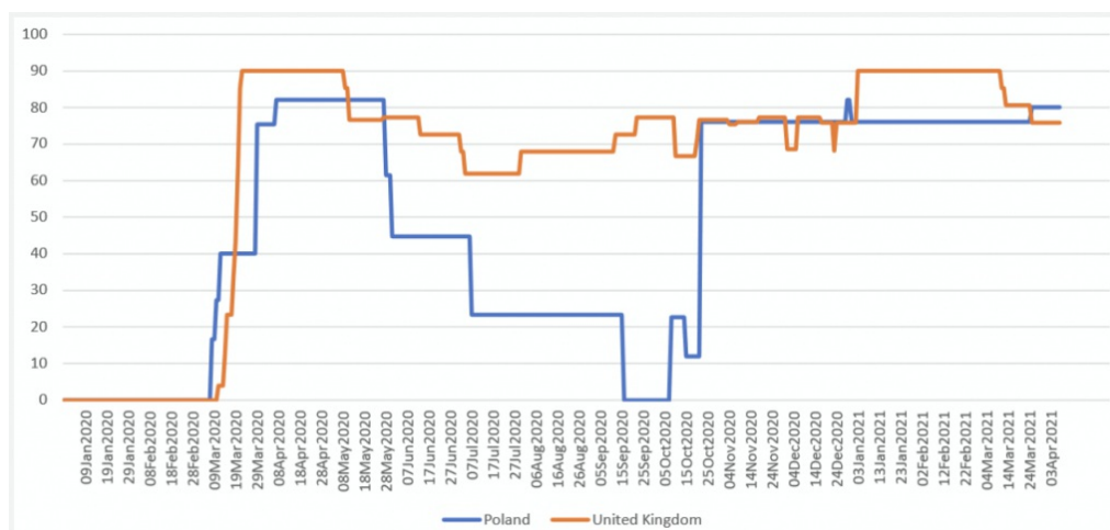
Figure 2: The economic severity index