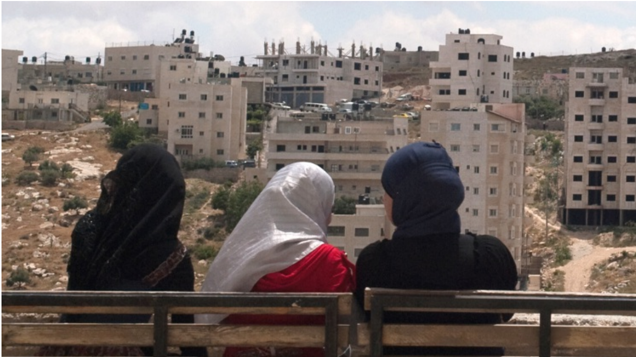
Image Credit: Cropped and brightened version of ' PalFest 2010 Day 2: Al-Quds University ' by PalFest licensed under CC BY 2.0 .

Women's Political Activism in Palestine is remarkable for its attention to detail that is skilfully pitched to appeal both to readers with interests in women's activism more generally and to those with a deeper regional knowledge specific to Palestine. This is evident in the thorough documentation of important governance contexts such as the UNSC Resolution 1325 (Chapter One) to the typology of political mobilising mechanisms (78-79) and the meticulous phenomenology of sumud (Chapter Three) that manages to reclaim something of its subtle anti-colonial dynamism. For scholars at different career stages, from student to professor, the text will prove a valuable resource for both teaching and research.