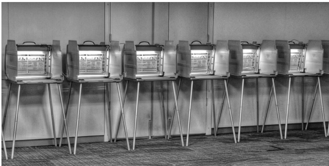
Polling station, California, 2018

In a book with such a large and broad scope, variations in chapter style, content and accessibility are unsurprising. Most chapters have a strong empirical base, but not all. Some, such as those on 'Electoral Systems and Citizen-Elite Ideological Congruence' and 'Portfolio-Maximizing Strategic Voting in Parliamentary Elections', are predominantly theoretical and, as such, present readers with assertions for which a research agenda is then needed for their testing. A few others are not general overviews either, but rather research reports, such as 'Electoral System Effects on Party Systems', the technical detail of which may test many readers.