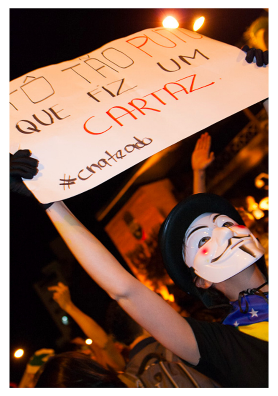
Figure 1: The performance of protest. A protester in Belo Horizonte during the June 2013 demonstrations wearing the Guy Fawkes mask with the Brazilian national flag rolled around the neck. The sign conveys the politically ambiguous message: 'I am so angry that I made a sign' followed by a hashtag indicating that the intended audience for this performance extends beyond the immediate event.

helmet and no mask. Aerial photos would show a few thousand supporters—most of whom were also not wearing masks. Yet, later that day, Bolsonaro was photographed as he arrived in Ecuador to attend the inauguration of president Guilherme Lasso—wearing the same clothes, but now also a mask. Bolsonaro's inconsistent use of the mask gives a visual dimension to what Ortega and Orsini