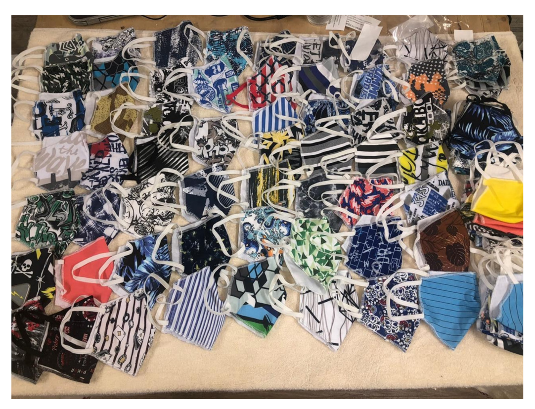
Figure 3: Masks on demand. Home-made masks being sold by a Belo Horizonte street vendor. The different colours and styles cater to the different tastes and needs of the clientele.

2020; Nogueira 2019). This flexible low-scale economy is quicker to respond to changes in weather, social trends and events, adapting their merchandise faster than formalised businesses. While ambulantes' previously-established spatial-temporal strategies have been partially disrupted by the pandemic and social isolation measures, masks have become a fundamental item for popular economy workers. Masks function both as products for sale and protection for the seller, which enable ambulantes to return to the streets and provide the means through which livelihoods are maintained (see Figure 3). Yet, the shift to the manufacture or sale of face masks is insufficient to compensate for the losses and uncertainty faced by most traders. Official data show that in July 2020 the average income of non-formalised workers had fallen to 72% of prepandemic income levels (Carvalho 2020). The situation was attenuated by the auxílio emergencial (emergency income support) which, from April to December 2020, had reached 40% of Brazilian households (IBGE 2020). However, circumstances deteriorated in 2021 after the scheme was reinstated following a pause but with much lower benefits and reduced cover. Although the flexibility and adaptability of the popular economy should be recognised and encouraged rather than dismissed by policy makers, the everyday uncertainty of ambulantes' livelihoods is nothing to be celebrated.