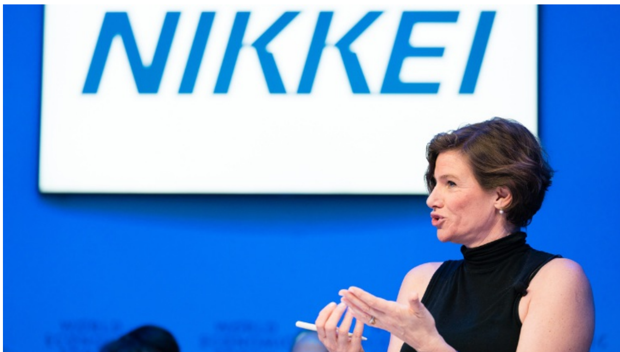
showing Mariana Mazzucato, Professor of Economics of Innovation and Public Value; Founder and Director, Institute for Innovation and Public Purpose, University College London (UCL) speaking in the How to Measure a New Economy session at the World Economic Forum Annual Meeting 2020 in Davos-Klosters, Switzerland, 23 January.

The cornerstone of her argument is the case study from which the book takes its name: the Apollo mission to put a man on the moon. From its start in 1962, President John F. Kennedy was explicit that this mission would be hard, cost a lot of money, that things would go wrong, but that its beneficial spillovers for society would be worth it. The mission had purpose, and inspired a generation. Innovation occurred across computing, communications and electronics, bringing about the IT revolution, while innovations in textiles and nutrition are still with us today. Mazzucato identifies six key lessons for tackling complex problems from Apollo, developing them into principles for a new political economy: 1) vision and a strong sense of purpose; 2) risk taking and innovation; 3) organisational dynamism; 4) cross-sectoral collaboration; 5) outcomes-based budgets and long-term horizons; and 6) dynamic public-private partnerships. Mazzucato goes on to explore the ways these can apply to present day net-zero strategies, green city programmes and missions to achieve the sustainable development goals.