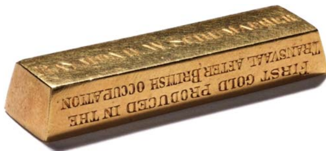
Figure 7. Gold Bar, Transvaal (South Africa), 1901.