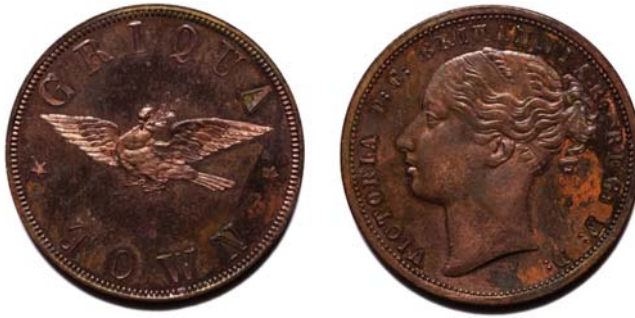
Figure 3. Penny pattern coin, struck in Berlin, Germany, for potential use in Griquatown, South Africa, 1890.

Note: Transfer from the US Mint. National Numismatic Collection, Smithsonian Institution.