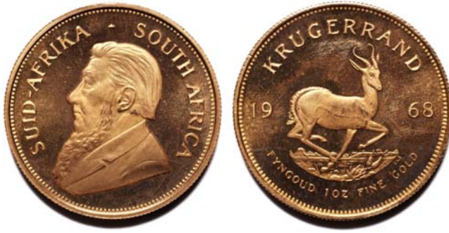
Figure 10. Krugerrand coin, 1968.

Note: Donated by the South African Mint. National Numismatic Collection, Smithsonian Institution.