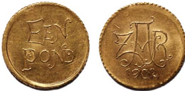
Figure 6. One Pond Coin ('veldpond'), South African Republic, 1902.

ZAR forces were then concentrated in an area called Pilgrim's Rest, and it was decided to combine the bar gold still in government hands with gold panned from the surrounding area to mint what became known as 'veldpond' coins. This required considerable experimentation using old farm machinery and whatever chemicals were available on