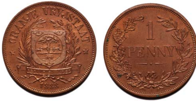
Figure 4. Penny pattern coin, struck in Berlin, Germany for potential use in the Orange Free State, South Africa, 1888.