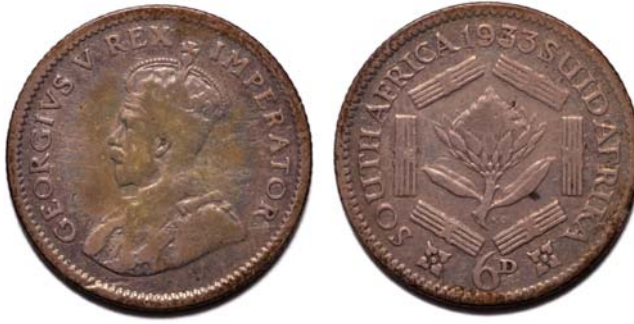
Figure 8. Six pence coin, South Africa, 1933.

Note: Donated by Carl H Jaeschke. National Numismatic Collection, Smithsonian Institution.