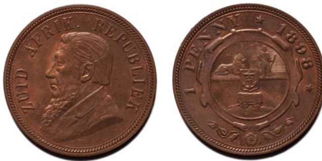
Figure 5. Penny coin, South African Republic, 1898.

After the 1881 agreement, discussions about the ZAR’s currency resumed. Before 1877, Burgers had purchased a minting plant while in Europe to negotiate a railway loan, but the minting plant never made it to the Transvaal. After 1881, the government received numerous other offers for the production of coins from the gold that was being discovered in the territory (Arndt 1928, 133–140). In 1890–1891 a lease was granted to the National Bank of the South African Republic to establish a state mint at Pretoria. In something of a reversal after the negative reaction to Burgers sovereigns , the Volksraad fully sanctioned a design for the new coins featuring the image of President Paul Kruger. While the Pretoria mint was under construction, the coins were minted in Berlin by the Imperial Mint (Shaw 1956, 21; Engelbrecht 1987, 75–76).