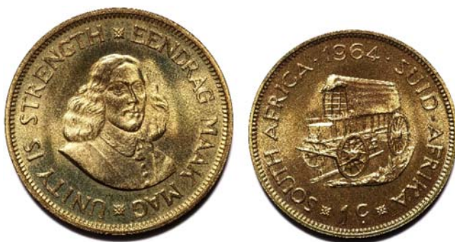
Figure 9. One cent proof coin, South Africa 1964.

Note: National Numismatic Collection, Smithsonian Institution.