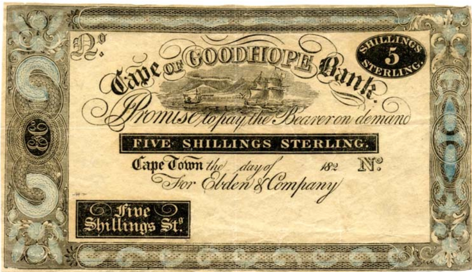
Figure 2. Five-shilling note, Cape Colony, late 1820s.

Note: Donated by the Chase Manhattan Money Museum. National Numismatic Collection, Smithsonian Institution.