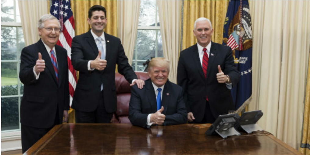
Mike Pence, Paul Ryan, Donald Trump and Mitch McConnell celebrate the passage of the Tax Cuts Act. December 2017.