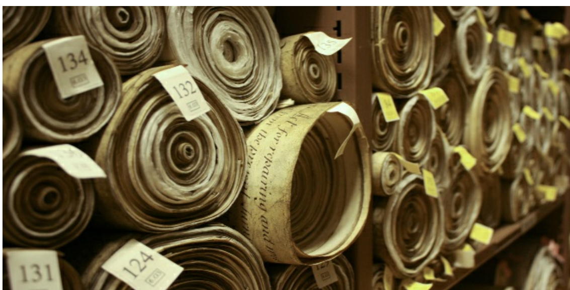
Image Credit: Parchment rolls of historical acts of Parliament, United Kingdom ( -JvL - CC BY 2.0 )