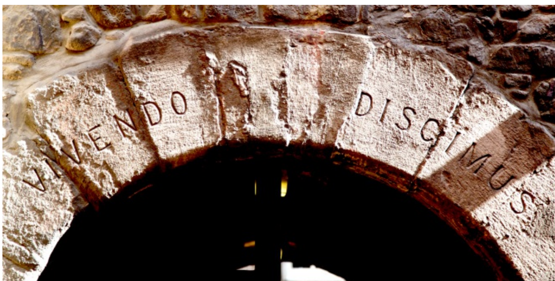
'By living, we learn...', Patrick Geddes Centre for Learning and Conservation, Edinburgh