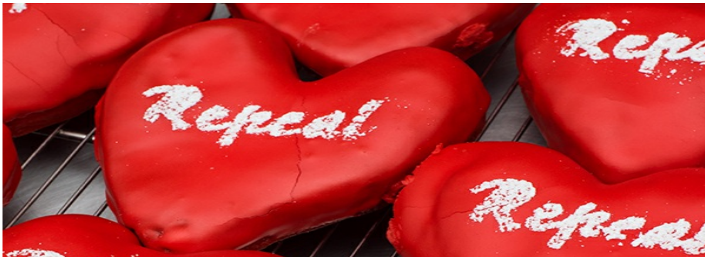
'Repeal the 8th' cookies.

Ireland's 2015 referendum on equal marriage and its 2018 one on abortion both had their origins in deliberative assemblies. But did such processes influence the result? The evidence suggests that the information and debate that came with these assemblies had an impact both on vote choice and turnout, writes Jane Suiter.