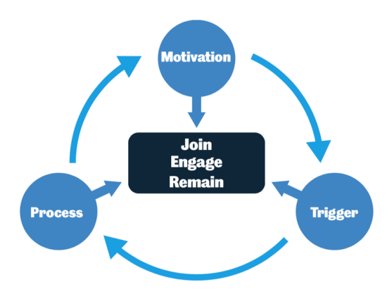
Figure 1: The membership journey

What is important about this model is that it can be used to not only explain why people join, but also to prescribe what organisations can do to boost the numbers joining, becoming active, and remaining within a group.