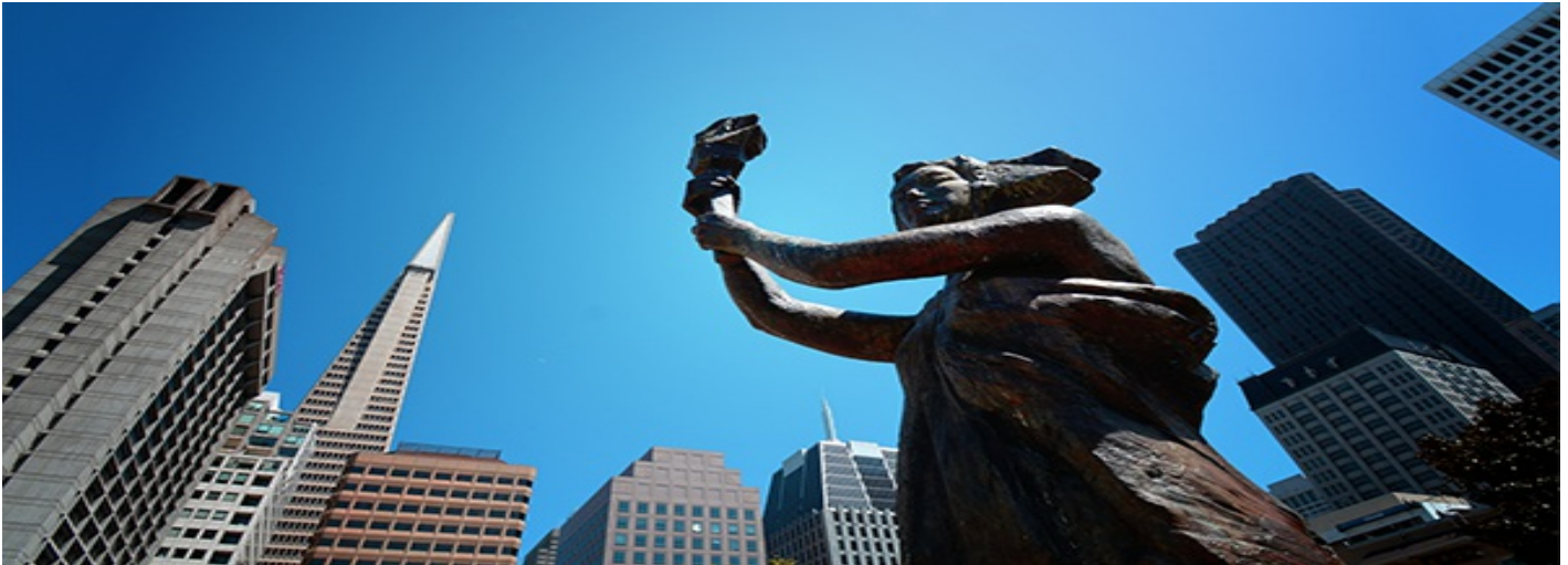
Picture: 'Goddess of Democracy' statue, San Francisco ( Eric Sonstroem CC BY 2.0 )

In Democracy Under Threat , editor Surendra Munshi brings together twenty contributors to explore the challenges facing democracy globally. While the collection largely avoids examining the role of capitalism in undermining democracy, this is a well-edited, stimulating and distinctive book that is highly recommended by Luke Martell .