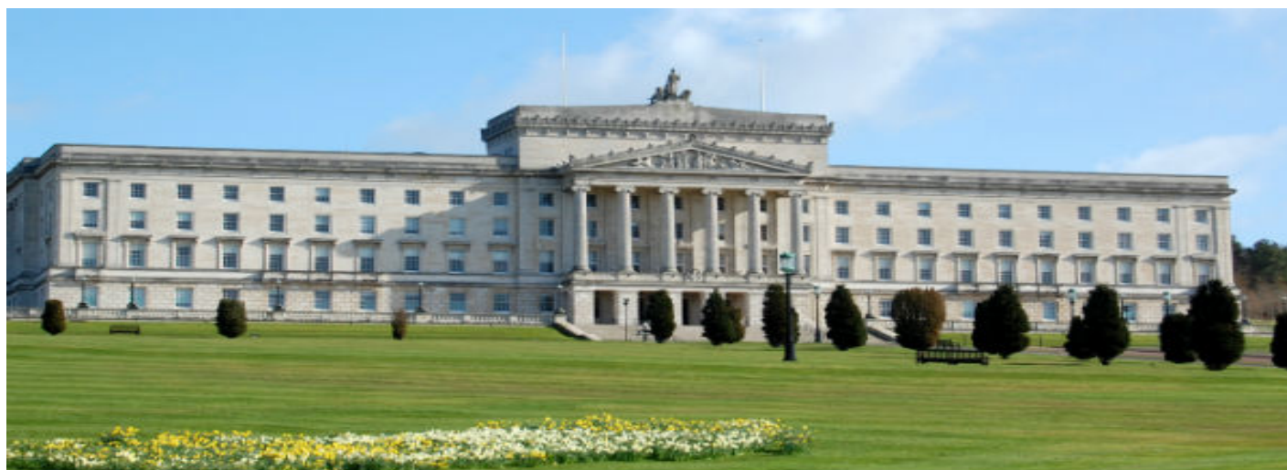
Stormont, the Northern Ireland Assembly.