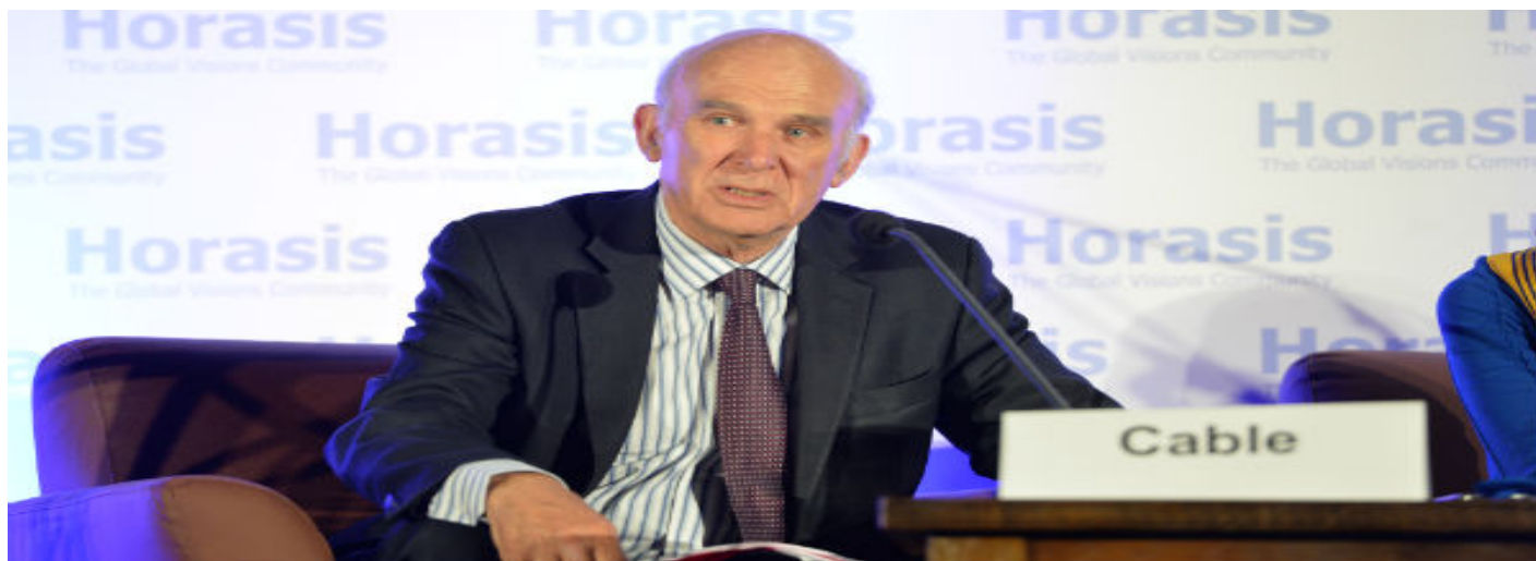
Vince Cable.