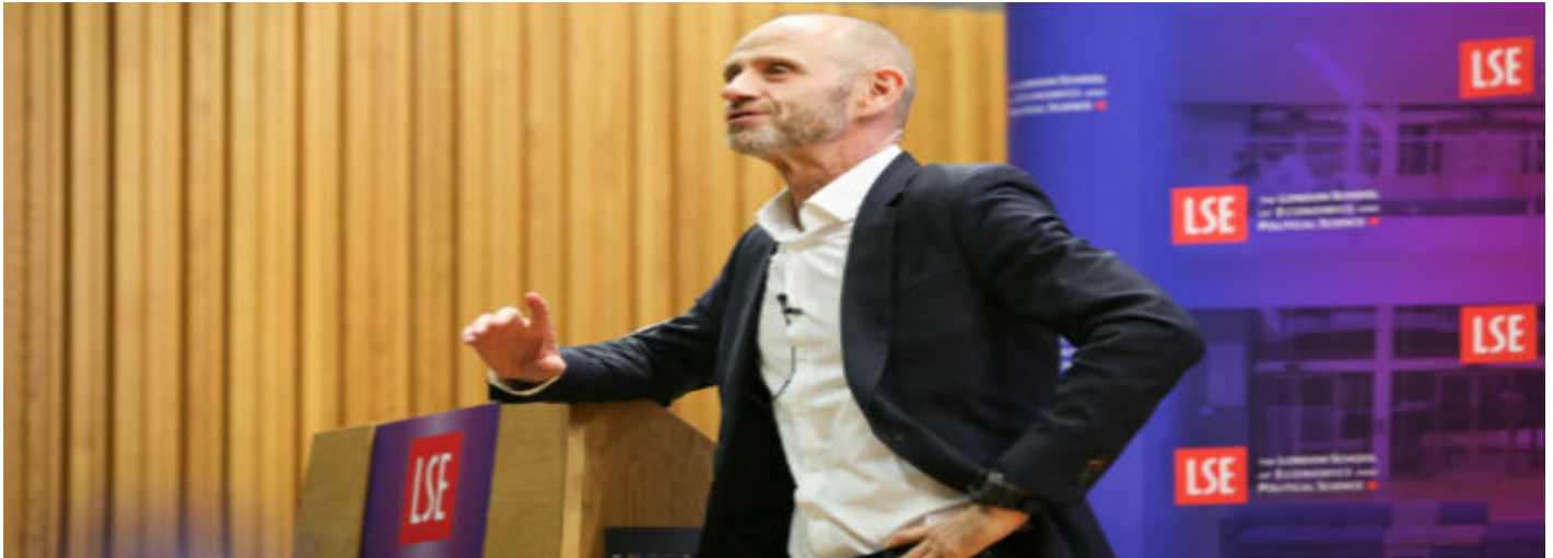
Author Evan Davis at LSE Institute of Public Affairs and Polis Lecture on 'Post-Truth', 18 October 2017