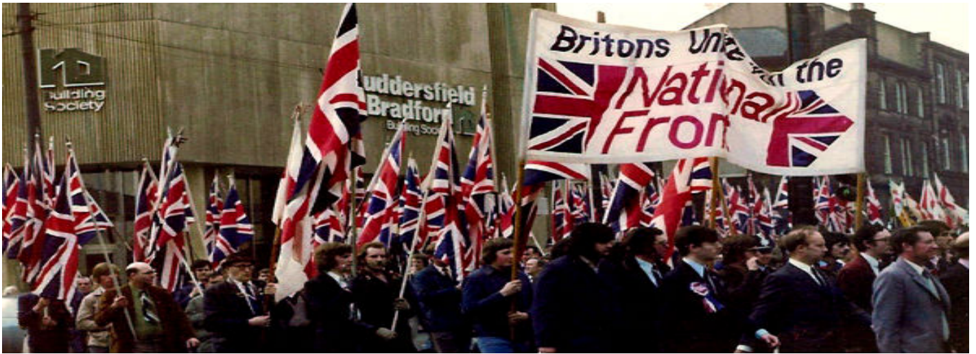
National Front March, Yorkshire, UK, 1970s