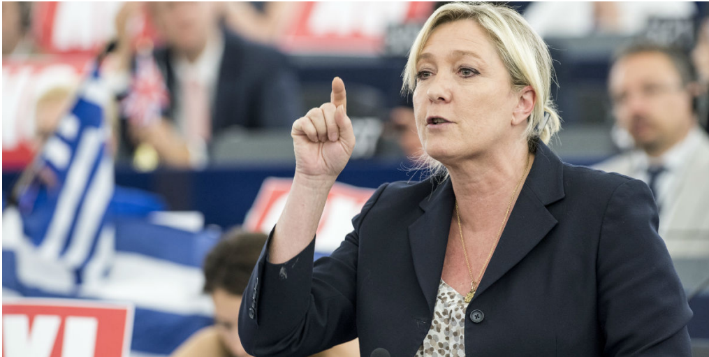
Marine Le Pen in the European Parliament.

With the growth of insurgent political parties that challenge the status quo, scholars are presented with a dilemma about how to categorise them. Takis S Pappas argues that nativist and populist parties are two distinct categories, and offers a set of criteria for classification.