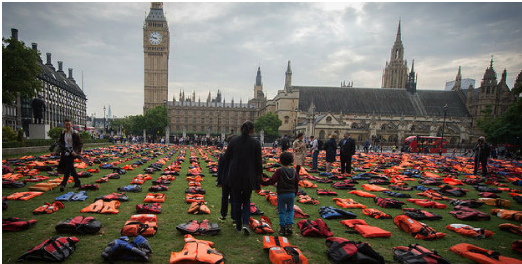
2,500 life jackets worn by refugees crossing to Europe, placed in Parliament Square, 2016.

The collection The Borders of 'Europe': Autonomy of Migration, Tactics of Bordering , edited by Nicholas De Genova, offers a compelling in-depth analysis of immigration to Europe through contributions that repeatedly go to the heart of contemporary policy conundrums. Suggesting ways in which scholar-activists can make a potential difference, this book offers a thorough education in the implications of Europe's evolving, unwieldy border apparatus upon the lives of migrants and Europeans, recommends Paul Clewett.