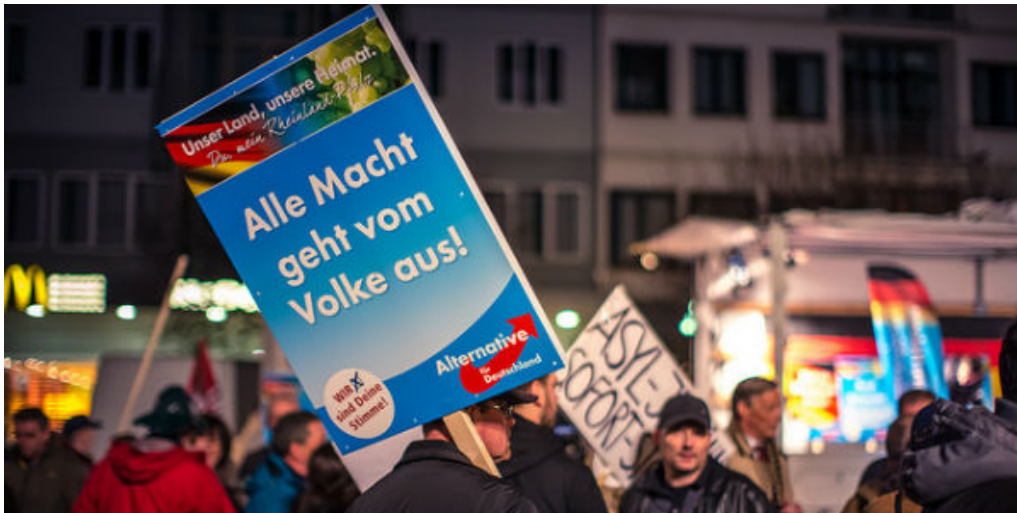
AfD demonstration, 2015.