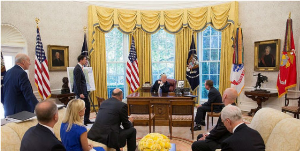
President Trump in the White House.