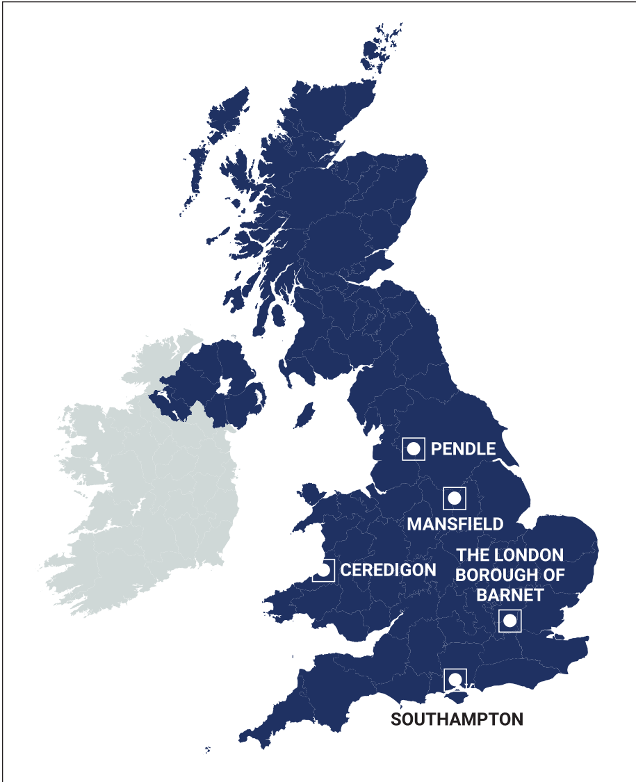
Figure 2. Location of our case study areas. Authors' elaboration.

Conservatives' margin significantly narrowed between the 2015 and 2017 general elections.