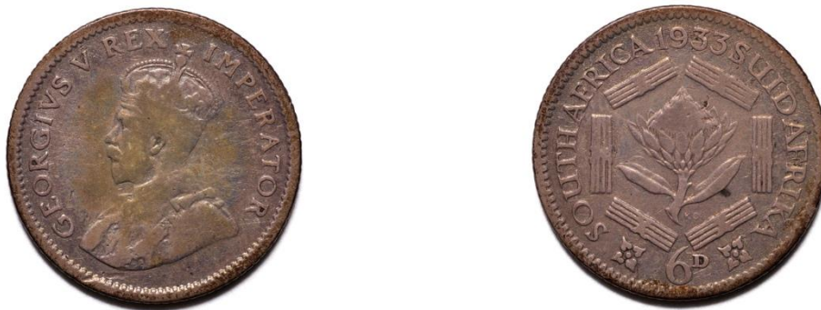
Figure 8 Six Pence Coin, South Africa, 1933