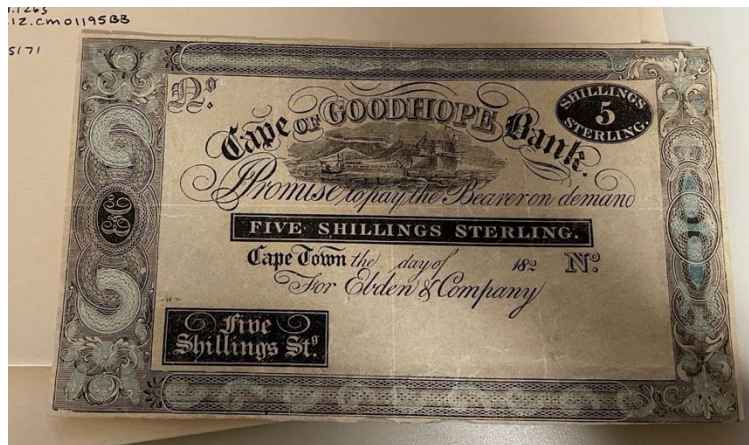
Figure 2 Five-shilling note, Cape Colony, late 1820s

Donated by the Chase Manhattan Money Museum. National Numismatic Collection, Smithsonian Institution.