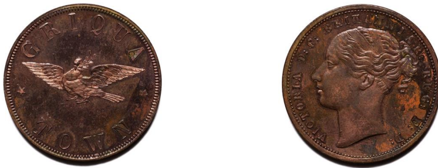
Figure 3 Penny pattern coin, struck in Berlin, Germany, for potential use in Griqua Town, South Africa, 1890

Transfer from the U.S Mint. National Numismatic Collection, Smithsonian Institution.