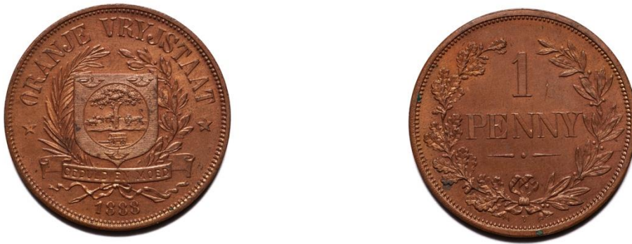
Figure 4 Penny pattern coin, struck in Berlin, Germany for potential use in the Orange Free State, South Africa, 1888.