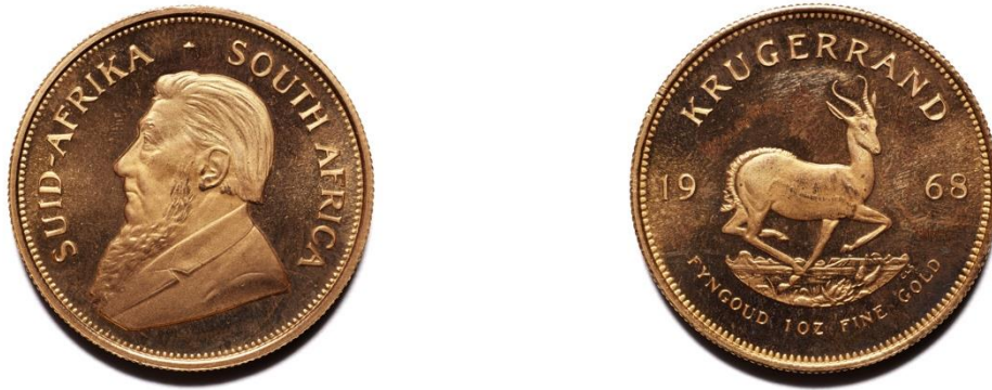
Figure 10 Krugerrand coin, 1968