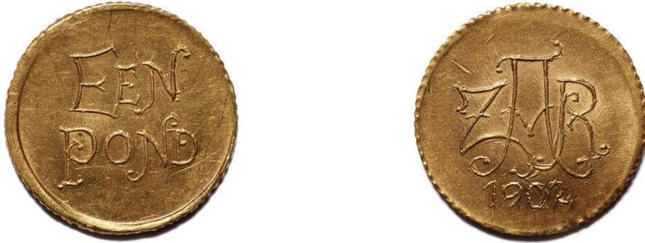
Figure 6 One Pond Coin ('veldpond'), South African Republic, 1902