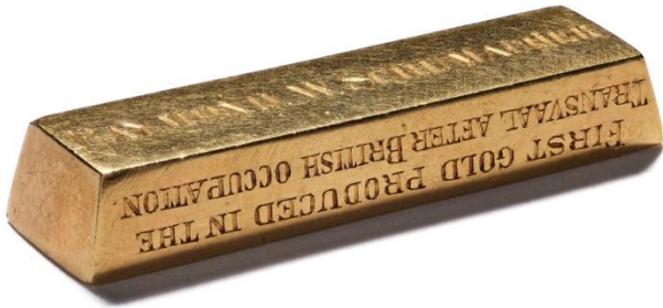
Figure 7 Gold Bar, Transvaal (South Africa), 1901.