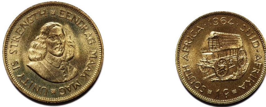
Figure 9 One cent proof coin, South Africa 1964

National Numismatic Collection, Smithsonian Institution.