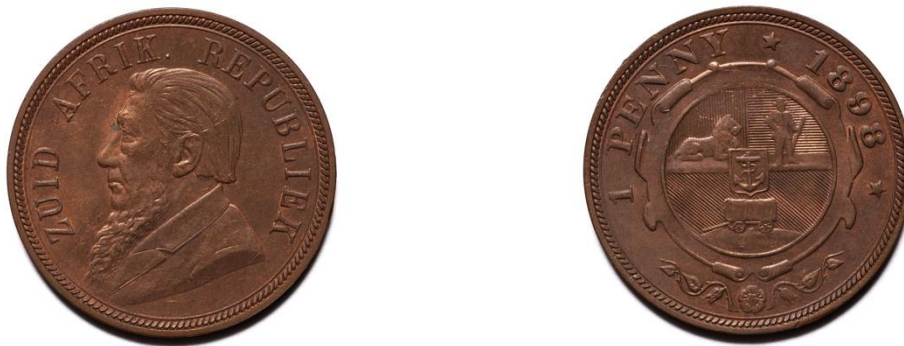
Figure 5 Penny coin, South African Republic, 1898.