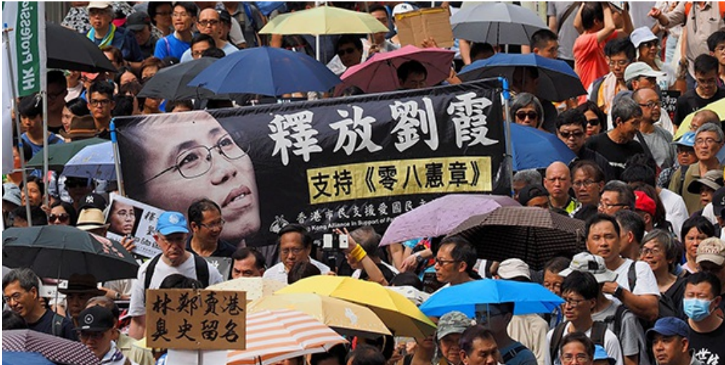
Democracy protestors, Hong Kong, 2018.

Studies of democratic diffusion have generally emphasised the role of geography in explaining waves of democratisation. Edward Goldring and Sheena Chestnut Greitens show that regime type has been significantly under-appreciated. Dictatorships often break down and even democratise along networks of similar regimes rather than via geographical proximity. Their work has important implications for questions of authoritarian survival and durability, as well as understanding the diffusion of political phenomena across the world, including in the UK.