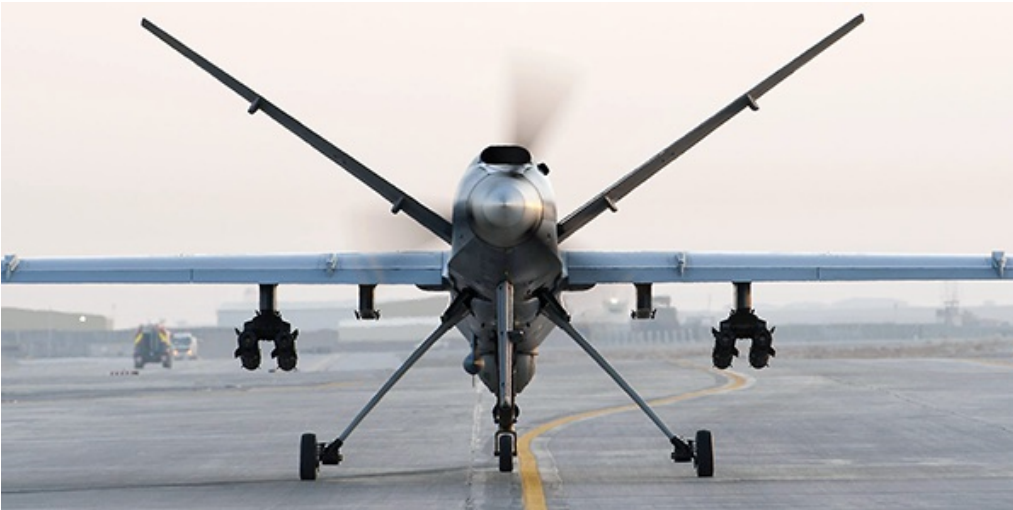
A Royal Air Force Reaper RPAS (Remotely Piloted Air System).

It is two years since the Intelligence and Security Committee published its report into UK lethal drone strikes in Syria. Despite a commitment to 'respond substantively to any report by the ISC within 60 days' the government has yet to produce a detailed reply to this report. Andrew Defty examines the government's record in responding to ISC reports and the changing nature of its commitment to doing so.