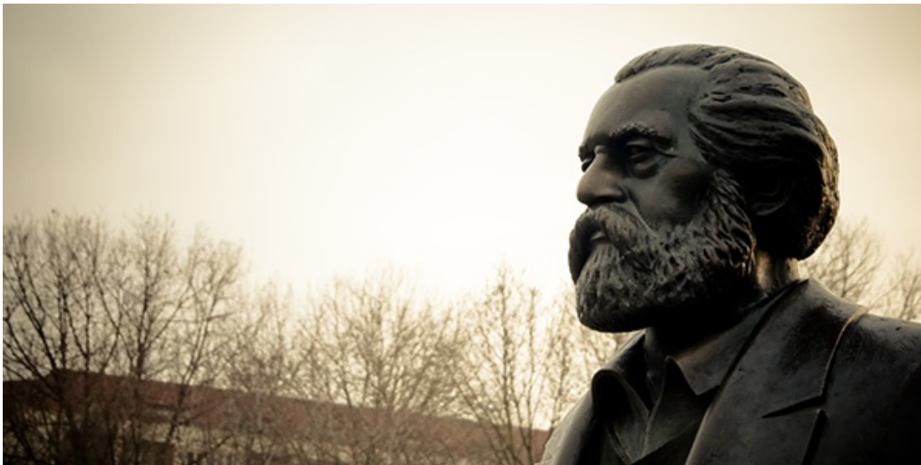
Statue of Karl Marx, Berlin.