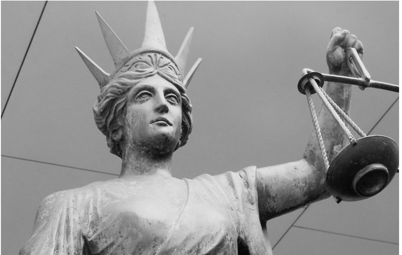
Image Credit: Scales of Justice, Brisbane Courts