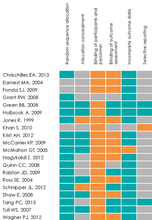
Figure 2 Risk of bias assessment cells were colour-coded in orange for high risk of bias, in green for low risk of bias and in grey if risk of bias was unclear.

(n=1), 26 fertility issues (n=1) 27 and pregnancy. 28 Five studies included service users in general, without focusing on a specific health condition. 29–33